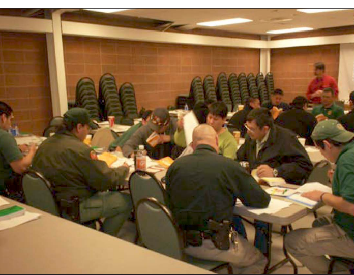
Small group activity during Clandestine Drug Lab training for members of the Crow Nation conducted by CLEAR's Workplace Safety Training Program at Jefferson State Community College.

For more information on JSCC visit: http://www.jeffstateonline.com/WST/index.aspx