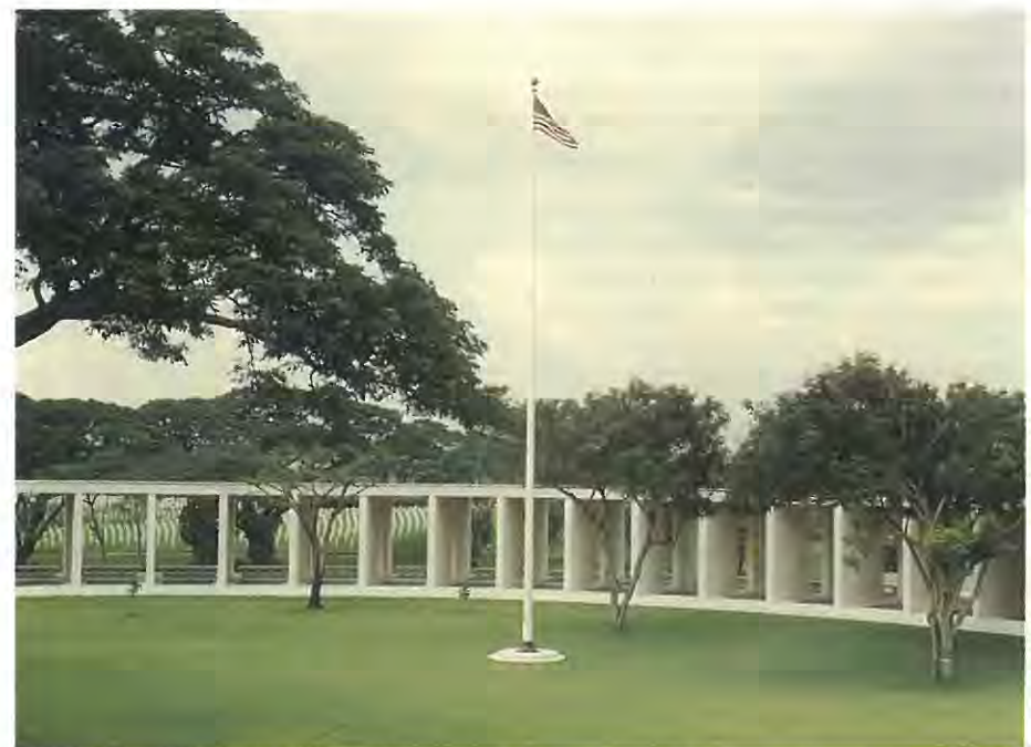
Tablets of the Missing with Graves Area in Background

SUBMARINES PERFORMED SPECIAL MISSIONS OF RECONNAISSANCE, SUPPLY AND RESCUE. THEY EVACUATED PERSONNEL FROM BELEAGUERED AREAS, NOTABLY FROM CORREGIDOR. THE SUPPLIES AND EQUIPMENT DELIVERED BY