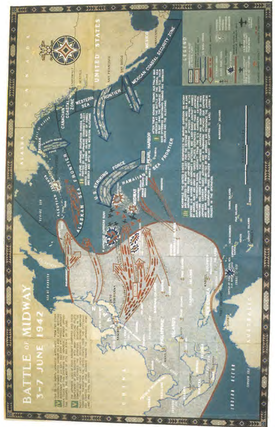
Operations Map—Southeast Room

BY-PASSING STRONGLY DEFENDED KOLOMBANGARA, THE U.S. 25TH DIVISION AND 3D NEW ZEALAND DIVISION CAPTURED VELLA LAVELLA. EFFORTS