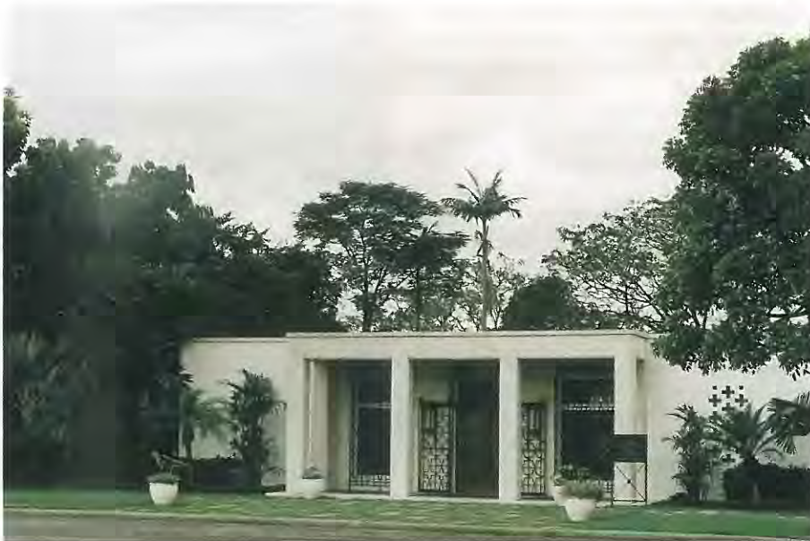
Visitors Building at Entrance Plaza

BOMBERS MAKING THE LONG OVER-WATER RETURN TO THE MARIANAS.