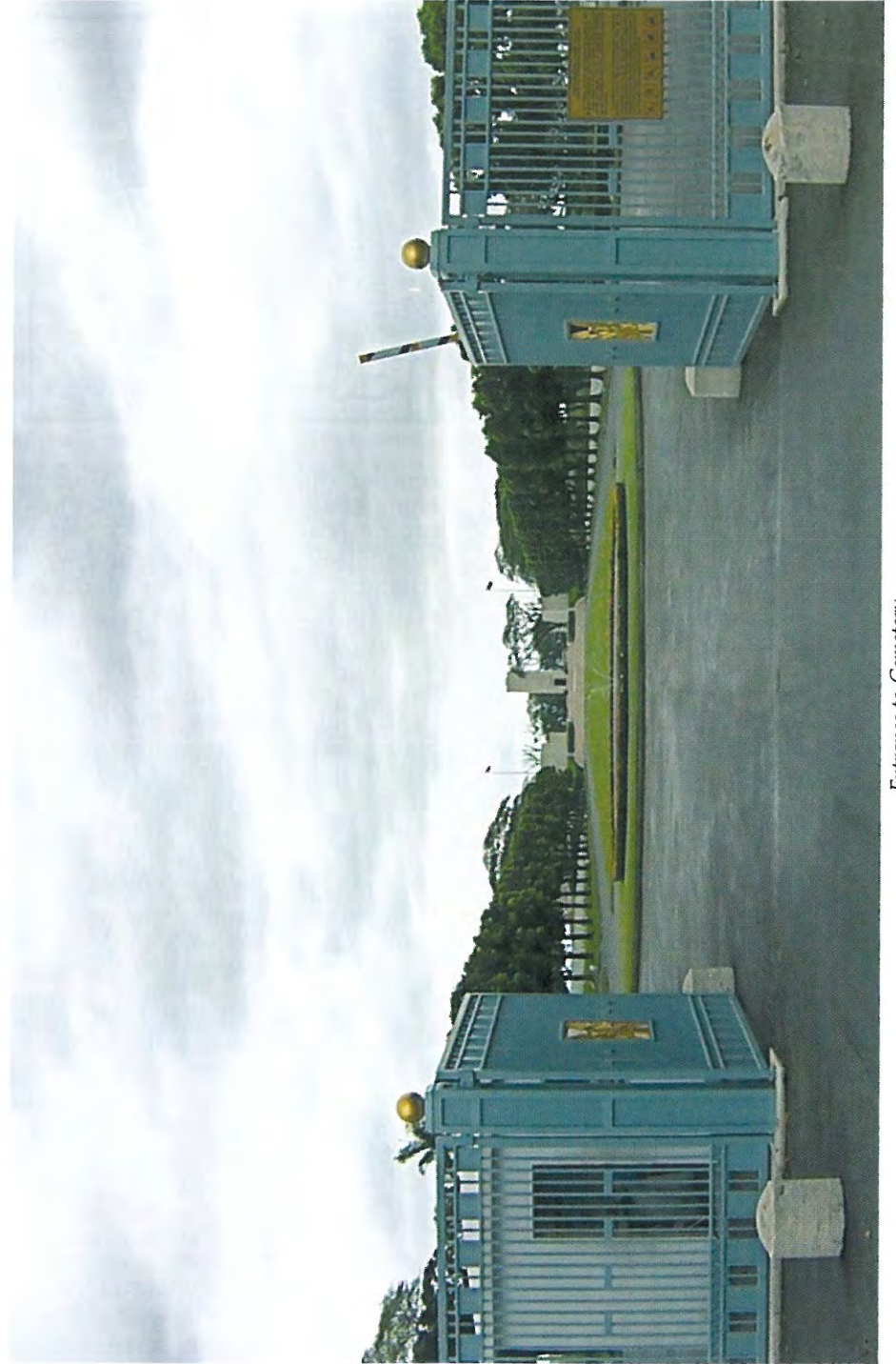
Entrance to Cemetery