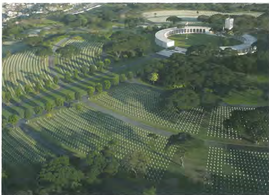
Aerial View of the Cemetery

Philippines and the East Indies in 1941 and 1942 or in the long but victorious return of the American forces through the vast island chain. The cemetery and memorial was completed in 1960. The cemetery was dedicated on 8 December 1960.