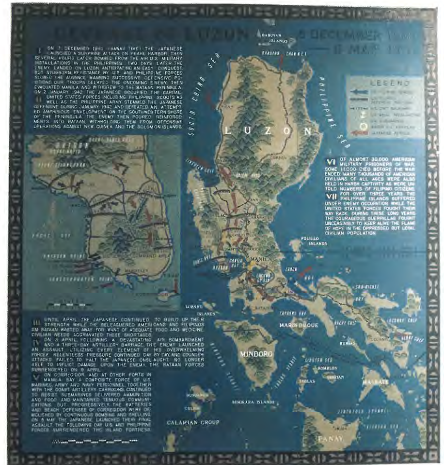
Operations Map—Southwest Room

THE UNITED STATES OF AMERICA, WHILE CONTRIBUTING HER LAND, SEA