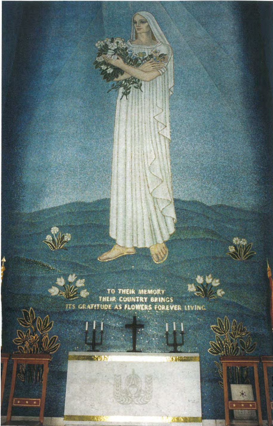
Altar in the Chapel