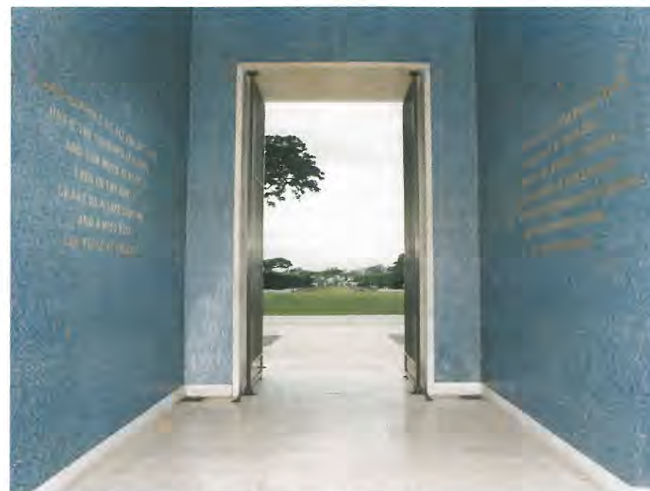
View From Inside Chapel Entrance

ON 3 APRIL, FOLLOWING A DEVASTATING AIR BOMBARDMENT AND A THREE-DAY ARTILLERY BARRAGE, THE ENEMY LAUNCHED AN ASSAULT UTILIZ-