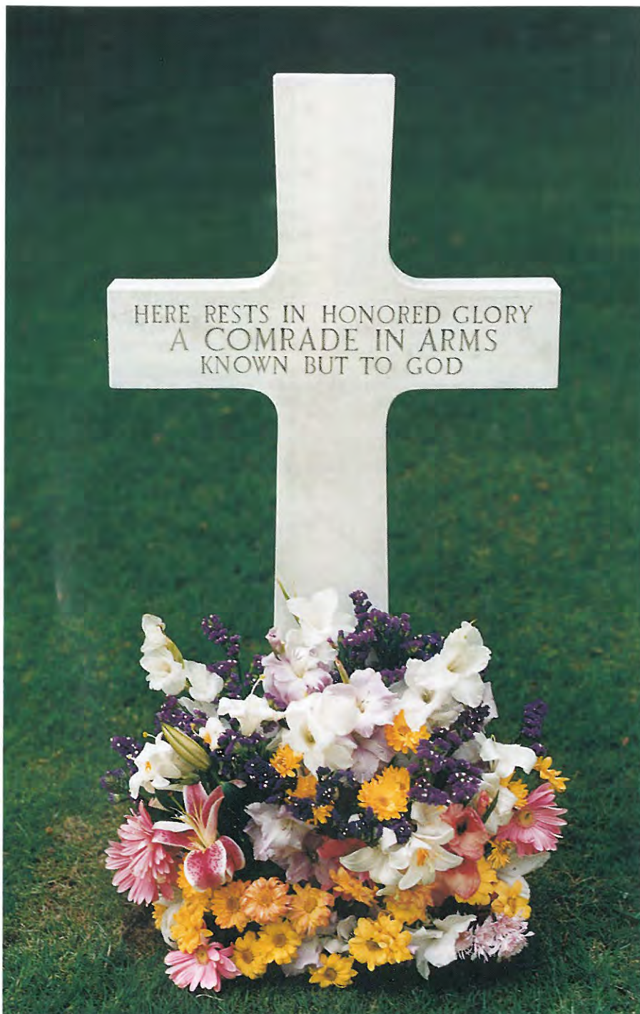
Decorated Gravesite of a World War II "Unknown"