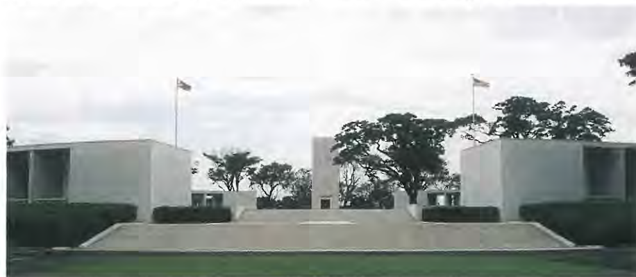
The Memorial Chapel With Hemicycles

In this cemetery are buried 17,202 of our military Dead representing 40 percent of the burials which were originally made in temporary cemeteries in New Guinea, the Philippines and other islands of the Southwest Pacific Area, and also in the Palau Islands of the Central Pacific Area. Most of these lost their lives in the epic defense of the