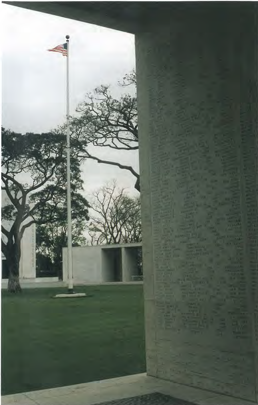
Interior of West Hemicycle Showing Inscribed Names

OF MOUNT SURIBACHI, CAPTURING THE SUMMIT. AN ASSAULT UP TO THE MOTOYAMA PLATEAU BROUGHT THE MARINES DIRECTLY INTO THE FACE OF THE HEAVIEST ENEMY DEFENSES. THEN AS THE 4TH DIVISION ATTACKED ON THE RIGHT AND THE 5TH DIVISION ON THE LEFT, THE 3D DIVISION IN THE CENTER CRACKED THE MAIN LINE OF JAPANESE RESISTANCE.