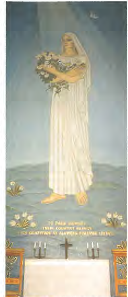
Interior of Chapel, Altar and Mosaic

EVEN BEFORE THE CAPTURE OF THE MARIANAS WAS COMPLETE, AIRFIELDS WERE BEING BUILT FROM WHICH THE U.S. TWENTIETH AIR FORCE WAS LATER TO CONDUCT ITS DEVASTATING BOMBARDMENT CAMPAIGN. FROM THE FIRST MAJOR STRIKE ON 24 NOVEMBER 1944 UNTIL THE END OF HOSTILITIES IN AUGUST 1945 THE OFFENSIVE CONTINUED WITH EVER MOUNTING INTENSITY. THE OBJECTIVE WAS THE PROGRESSIVE DESTRUCTION OF THE