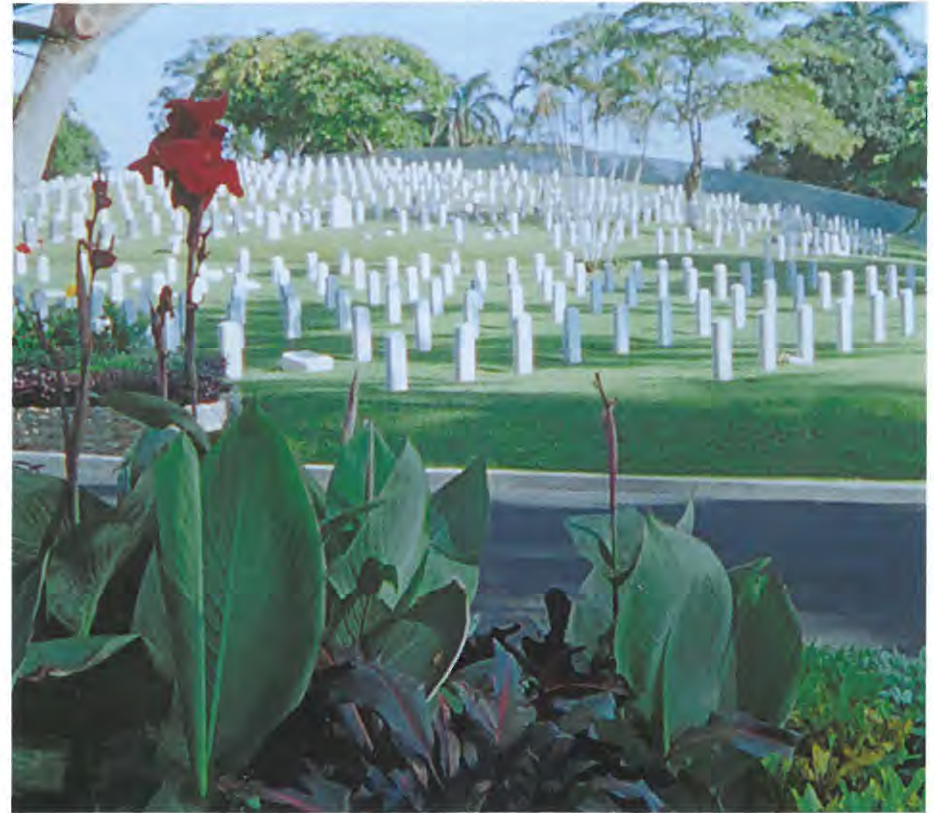
Corozal American Cemetery, Corozal, Republic of Panama