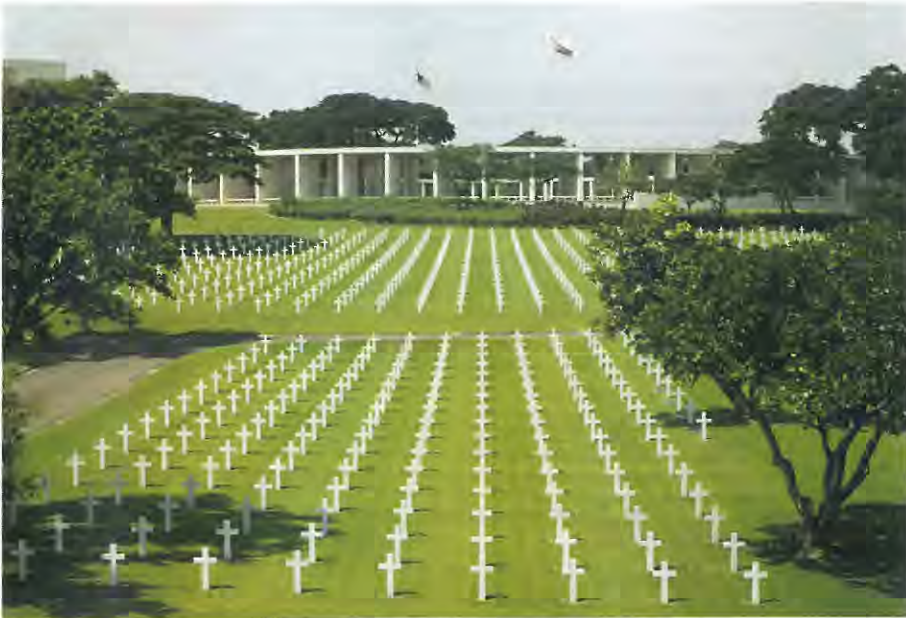
Graves Area with East Hemicycle in Background

AMERICAN AIRCRAFT WERE LAUNCHED AT SUCH LONG RANGE, SO LATE IN THE DAY, THAT A PERILOUS NIGHT RECOVERY WAS INEVITABLE. NEVERTHELESS, THE AMERICAN PILOTS BOLDLY PRESSED THEIR ATTACK AND SANK A CARRIER AND TWO TANKERS. MANY AIRCRAFT FAILED TO RETURN.