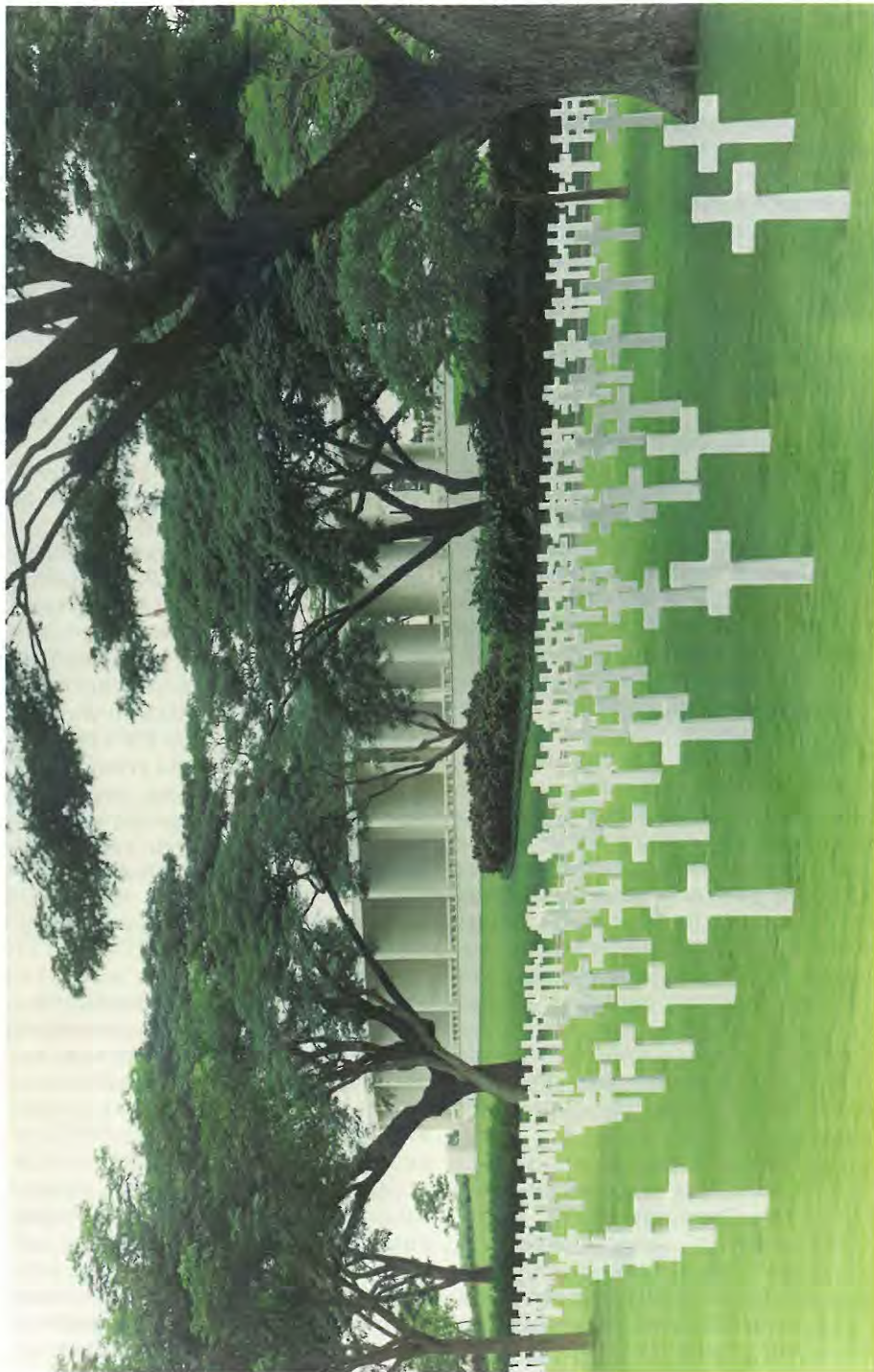
Memorial Hemicycles from the Rear

OF THESE BOMBARDMENTS AND THE TREMENDOUS POTENTIAL FIRE POWER OF THE THIRD AND SEVENTH FLEETS INDUCED THE JAPANESE ON LUZON TO WITHDRAW THEIR MAIN FORCES FROM THE BEACHES AND CONCENTRATE THEM IN DEFENSIVE POSITIONS IN MOUNTAINOUS AREAS OF THE INTERIOR.