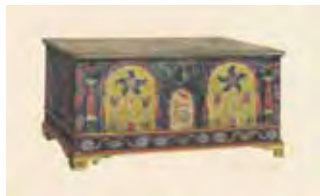
Pennsylvania German Chest, 1935/1942, Index of American Design