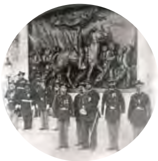
Veterans of the Massachusetts Fifty-fourth Regiment at the ceremony in Boston unveiling the Shaw Memorial , May 31, 1897