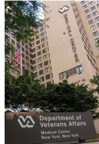
New York Harbor Health Care System, New York Campus