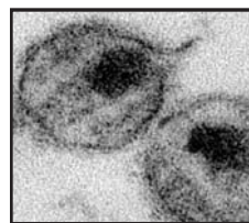
Detail of two human immunodeficiency virus (HIV) particles, or virions.

Nursing CBI initiative is to provide an opportunity for a non-CBI nurse to partner with a CBI nurse and co-lead an initiative at their local facility to enhance the care of veterans with chronic blood-borne infections. The goal of our local project was to improve the identification and referral of veterans with undiagnosed HIV. Our target population consisted of the 5,900 veterans enrolled in the MHC. A random sampling of 100 patients revealed that less than one-third had ever been tested for HIV even though many had risk factors for infection, especially those enrolled in our Substance Abuse Relapse Prevention (SARP) program. When we initially wrote our proposal, the only providers in the MHC ordering HIV tests were Daragh Murphy and another MHC primary care nurse practitioner. Our plan was to expand testing within the MHC so that patients could be counseled by a provider with whom they had a pre-existing therapeutic relationship, such as their psychiatrist. The first major hurdle we faced was convincing providers that HIV counseling and testing does not need to be done by an HIV specialist. Understandably, many MHC providers were not used to ordering HIV tests. In order to raise awareness about HIV testing among patients and staff, my colleague, Ms. Maggie McGibbon (an HIV social worker), and I conducted an HIV Rapid Oral Testing Day in the MHC.