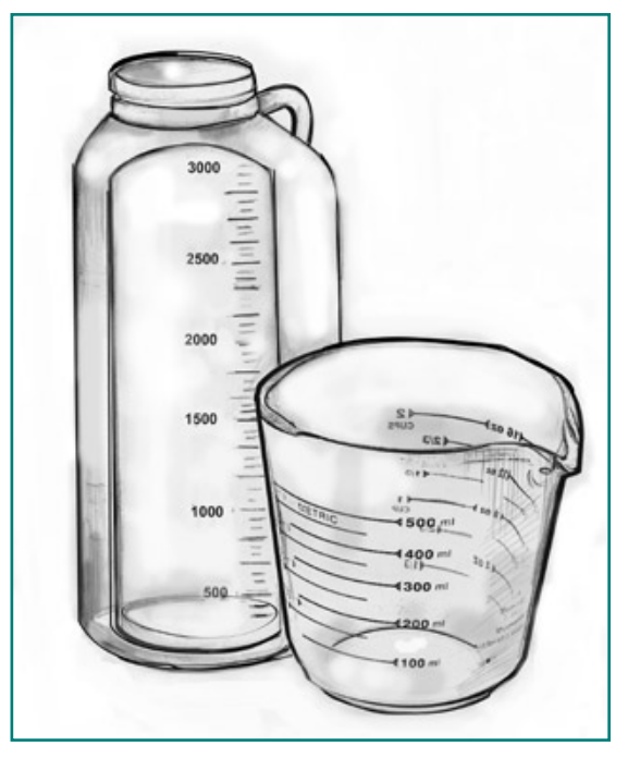
Containers for a 24-hour urine collection.

Until recently, an accurate protein measurement required a 24-hour urine collection. In a 24-hour collection, the patient urinates into a container, which is kept refrigerated between trips to the bathroom. The patient is instructed to begin collecting urine after the first trip to the bathroom in the morning. Every drop of urine for the rest of the day is to be collected in the container. The next morning, the patient adds the first urination after waking and the collection is complete.