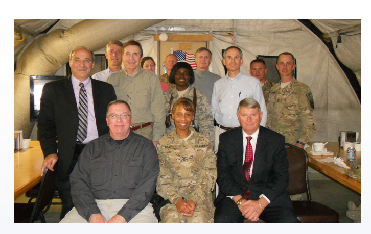
Meeting of DoD IG, SIGAR, AAA, and IGs for USFOR-A and CSTC-A.