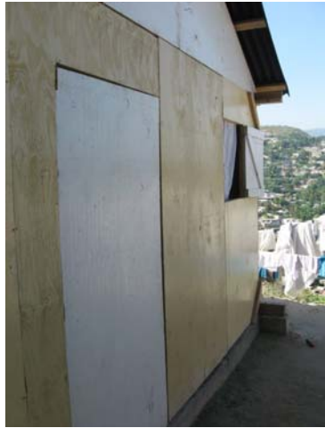
At left stands a transitional shelter built with plastic sheet walls, no solid doors, no windows, and no foundation. At right, an open window allows air to circulate in a transitional shelter built with plywood walls, doors, windows, and a concrete foundation. (Photos by OIG, November 2010)

Despite its experience constructing transitional shelters after major disasters for the past 7 years, USAID/OFDA did not provide direction to grantees on a standard shelter design. Instead, it left the 11 grantees to design their own transitional shelters.