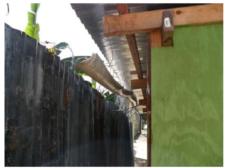
Beneficiary-installed gutters collect rainwater on shelter constructed by ADRA.

With its experience in shelter construction, USAID/OFDA could develop a standard shelter design that could be consistently and rapidly implemented using an appropriate procurement instrument. A standard design also would reduce the cost of duplication of efforts in designing numerous shelter solutions. Reducing implementation time would hasten economic recovery after a disaster. Therefore, we are making the following recommendations: