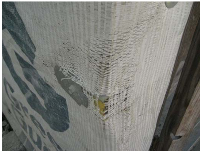
A transitional shelter constructed with thin plastic sheeting shows wear.

Sphere standards state that shelter solutions should ensure the security, health, safety, and well-being of the affected population. Haitian beneficiaries complained to grantees that they feared for their safety while living in shelters with no doors and plastic-sheeted walls, which could easily be cut with a knife. Some of the plastic sheeting provided was so thin that at night the inhabitants within were visible from outside the shelter. In addition, over time the plastic sheeting (shown below) began to wear and was unlikely to last the 3 years that USAID/OFDA required.