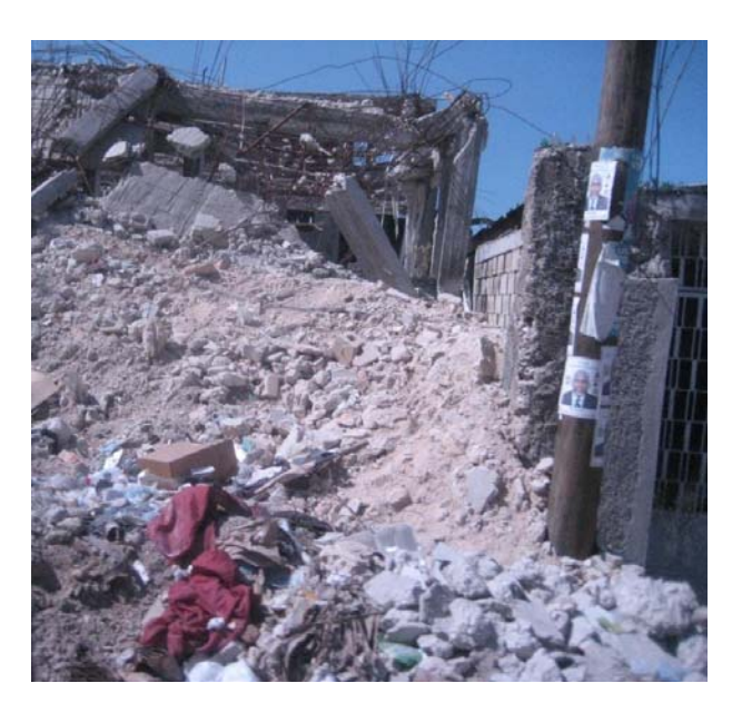
Roadside rubble in Port-au-Prince occupies potential building sites. (Photo by OIG, November 2010)

Because USAID/OFDA did not anticipate the amount of rubble, it did not take appropriate steps to mitigate the problem, which eventually impeded achieving intended results. Rubble remains one of the factors that will most limit the ability of grantees to build shelters in urban areas. While the job of rubble removal is not USAID/OFDA's alone, incorporating a more effective method for rubble removal into the grant's scope of work could have helped accelerate shelter construction and aided USAID/OFDA in meeting its target number of shelters 1 year after the earthquake.