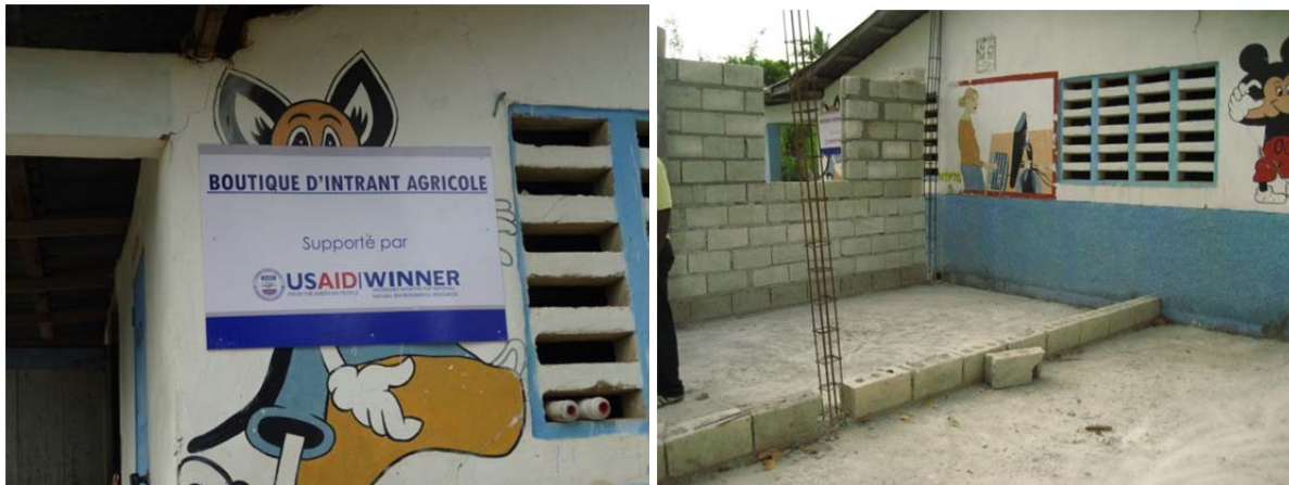
Sign indicates the agrosupply store located in a kindergarten (left) while construction proceeds on a new store adjacent to the kindergarten. (Photos by the Office of Inspector General, August 5, 2011)

In several stores, auditors observed opened bags of WINNER-provided chemically treated Monsanto corn seed (shown on the previous page). This corn is treated with, among other things, deltamethrin, which is a restricted-use pesticide 13 with a Class I 14 toxicity level. Instructions for application are attached to the bag but are in English. One such store was located in the kindergarten shown above, 15 and the treated corn seed was found on the ground inside and outside the store shown above. In addition, the store located in the kindergarten did not stock any protective equipment such as gloves or masks. As reported in the PERSUAP, unsafe handling of pesticides is dangerous to health and the environment.