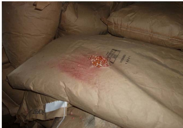
Label on chemically treated Monsanto seed warns of environmental hazards (left); open bags (right) near the kindergarten-based store. (Photos by the Office of Inspector General, July 28 and August 5, 2011)