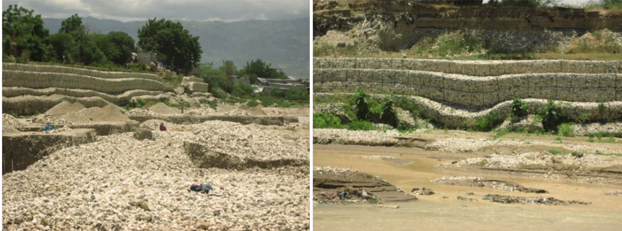
River sediment mining weakens gabions (left) and eventually results in their collapse (right). (Photos by the Office of Inspector General, July 29, 2011)

Tomas in November 2010. Workers told us they could make $10 per hour—significantly higher than the national minimum wage of $5 per day—by extracting river sediments, which can be used in making building materials. With an unemployment rate in Haiti of 41 percent 11 and the demand for building materials remaining high since the January 2010 earthquake, mining sediment is an economically attractive option.