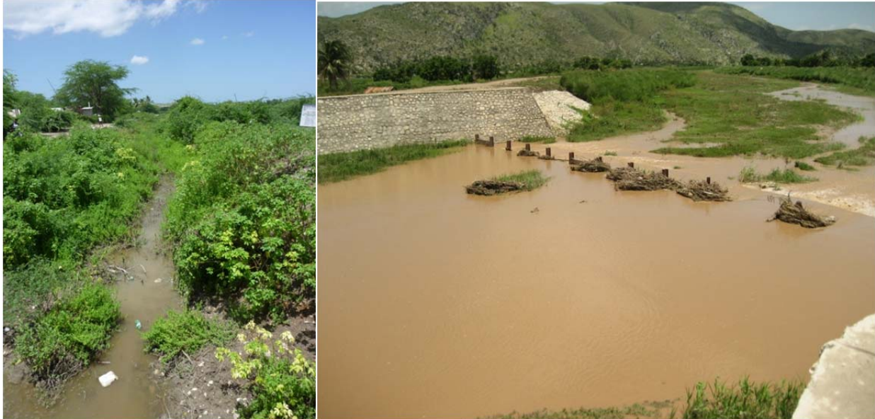
Cleanup of the overgrown drainage canal (left) was cancelled after the shift in program focus, and the La Quinte River widening (right) is at risk without maintenance.

Because of the mission's desire to implement the revised strategy rapidly, USAID/Haiti did not evaluate the impact of the halt of activities in the Gonaïves/La Quinte watershed as economic, efficient and effective program management would dictate. To ensure that USAID/Haiti considers the impact of cancelling activities in the Gonaïves/La Quinte watershed, we make the following recommendation.