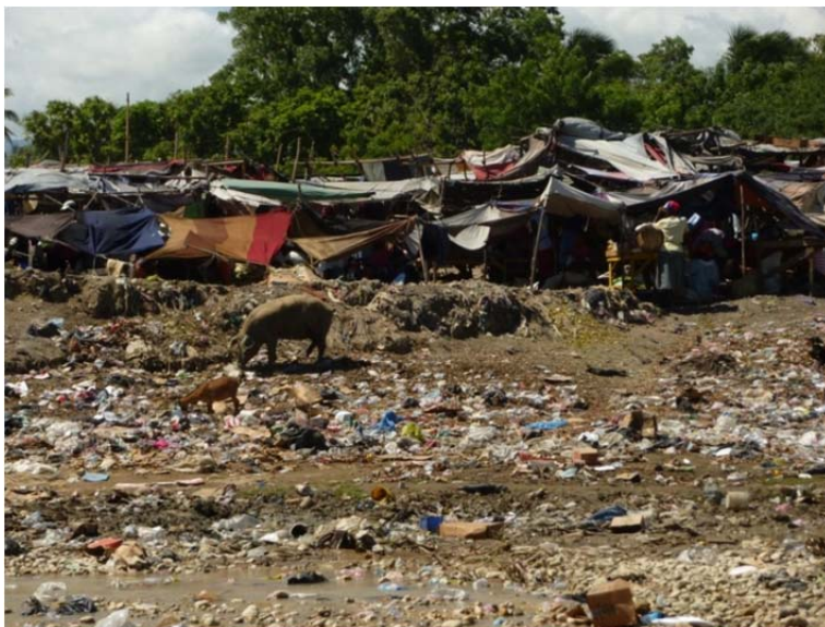
Garbage accumulates in a site recently cleared of garbage by the program. (Photos by the Office of Inspector General, July 29, 2011)

Dumping Trash. Uncontrolled dumping of trash in sites like the one shown below has occurred since the start of the project, even during the dredging operation. According to a local resident, there is no system of trash removal in the community, making the river the most accessible place to dispose of trash. The uncontrolled dumping is refilling the areas where Chemonics has dredged.