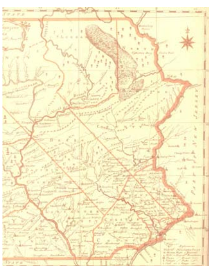
1937 reprint of a map in the January 1788 issue of Philadelphia's Columbian Magazine . Newlyformed Luzerne County is shown at top center.

At his request, the Pennsylvania State Assembly had granted Pickering several civil offices in newly-formed Luzerne County, where his land was located, and asked him to mediate disputed land claims in the area – dangerous work. Pennsylvania and Connecticut settlers were at odds, and both groups distrusted the government. Pickering persevered. He faced angry mobs and slept with a gun to protect himself. In the summer of 1788 a band of angry settlers, dressed as Indians, abducted Pickering and fled with him through the woods for 19 days, dodging a pursuing militia. They hoped to exchange him for one of their own, jailed for political reasons in Philadelphia. When it became clear that Pickering was useless as a bargaining chip, he was released. Ultimately, Pickering could not bring peace to the area because of lack of political support in Philadelphia.