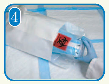
Place the sealed Saf-T-Pak inner leakproof polybag (or equivalent) inside a white Tyvek <sup>®</sup> outer envelope (or equivalent). Note: If primary receptacles do not meet the internal pressure requirement of 95 kPa, use compliant secondary packaging materials.