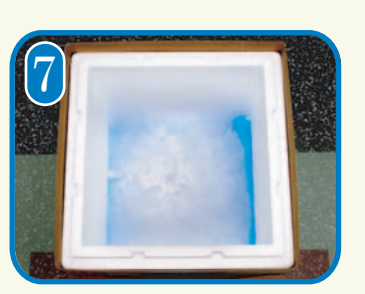
Place a layer of dry ice in the bottom of the shipper on top of the absorbent material. DO NOT use large chunks or flakes of dry ice.