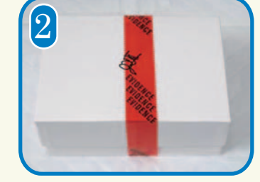
Use one continuous piece of evidence tape to seal the gridded box or the box containing wrapped urine cups. Write initials half on the evidence tape and half on the box.