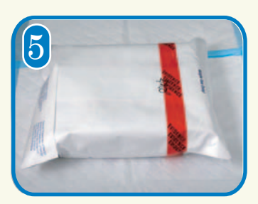
Seal the opening of this envelope with a continuous piece of evidence tape. Write initials half on the evidence tape and half on the envelope.