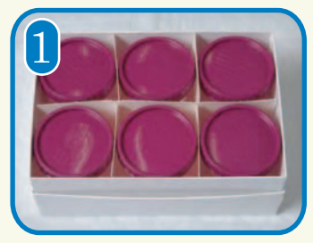
Place urine cups in a gridded box lined with absorbent material, or alternatively place each cup inside a leak-proof biohazard polybag (or equivalent) and then place wrapped urine cups into a box.

For detailed instructions, see CDC's Shipping Instructions for Specimens Collected from People Who May Have Been Exposed to Chemical-Terrorism Agents.