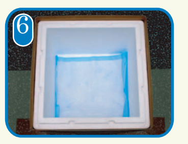
Use polystyrene foam-insulated, corrugated fiberboard shipper to ship boxes to CDC. Place absorbent pad in the bottom of the shipper.