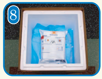
Place the packaged urine cups in the shipper. Use absorbent material or cushioning material to minimize shifting while box is in transit. Place additional dry ice on top of samples.