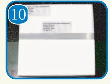
Secure the outer container lid with filamentous shipping tape. Place your return address in the upper left-hand corner of the shipper top and put the CDC Laboratory receiving address in the center.

Place the urine shipping manifest in a sealable plastic bag and put on top of the sample boxes inside the shipper. Keep your chain-of-custody documents for your files. Place lid on the shipper.