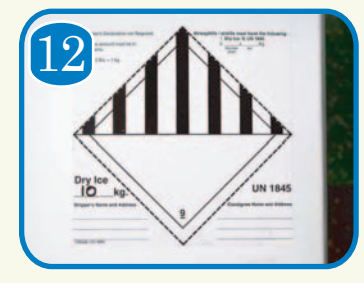
Place a Class 9/UN 1845 label on the front of the shipper. This label for dry ice MUST indicate the weight of dry ice (in kg) in the shipper and the proper name (either dry ice or carbon dioxide, solid).