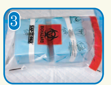
Wrap the box with absorbent material and secure with tape. Seal the box inside a Saf-T-Pak inner leak-proof polybag (or equivalent).