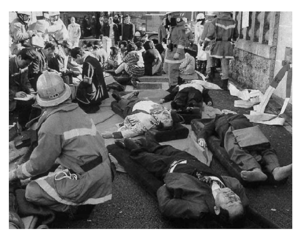
Figure 10-3 Triage after sarin attack, Tokyo subway, 1995