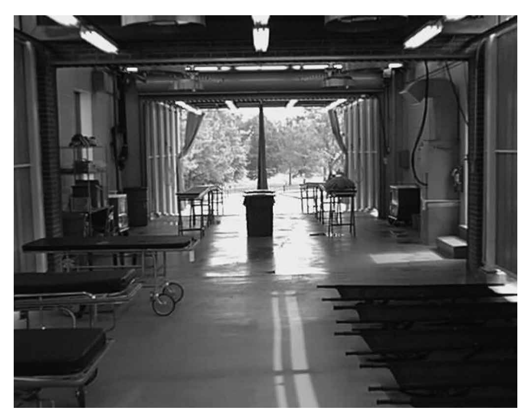
Figure 10-5 Dining hall patio for ambulatory decontamination