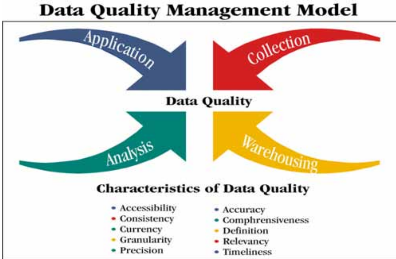
Figure 3. Data Quality Model

(American Health Information Management Association. Practice Brief – Data Quality Management Model. Chicago: AHIMA, June 1998)