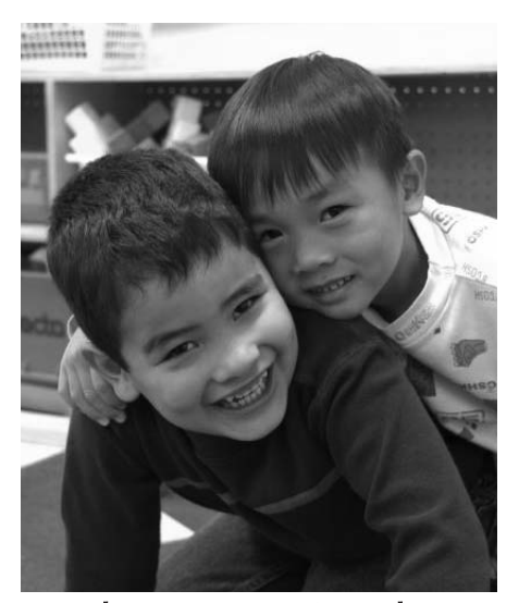
Dual Language Learning: What Does It Take? Head Start Dual Language Report