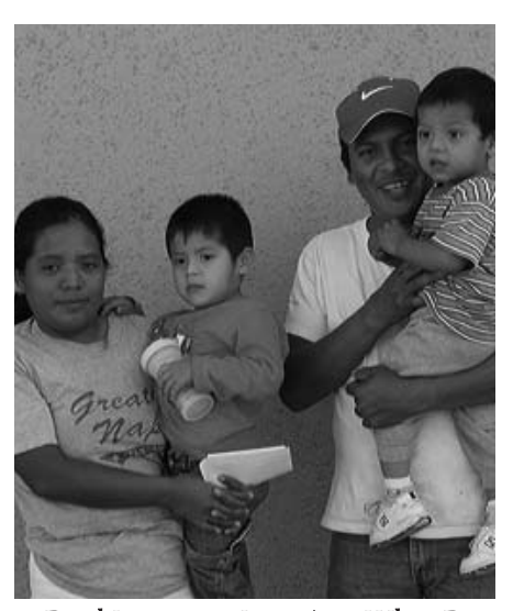
Dual Language Learning: What Does It Take? Head Start Dual Language Report

Demographic data also tell us that the geographic distribution of America's culturally and linguistically diverse families is changing—in some cases rapidly. A number of states, including New York, New Jersey, Florida, and the Southwest border states (Texas, Arizona, New Mexico, California) have a long history of working with immigrant families. Yet more recently, and often within a matter of a few years, many communities throughout the United States are experiencing significant influxes of immigrant families—at times because a new industry has attracted a particular immigrant group, at other times because of refugee resettlements or changes in migration patterns. Programmatic needs vary significantly depending on the mix of the families they serve, but also on how quickly their service population has changed. This has implications for outreach, staffing, organizational culture, family involvement, community partnerships, educational resources and materials, and a host of other issues, many of which are delineated in the findings section of this report.