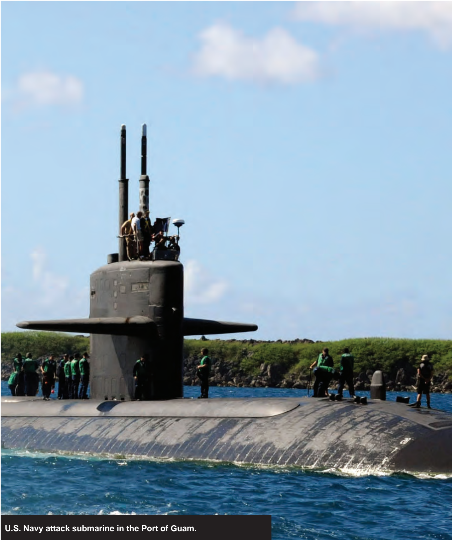
U.S. Navy attack submarine in the Port of Guam.