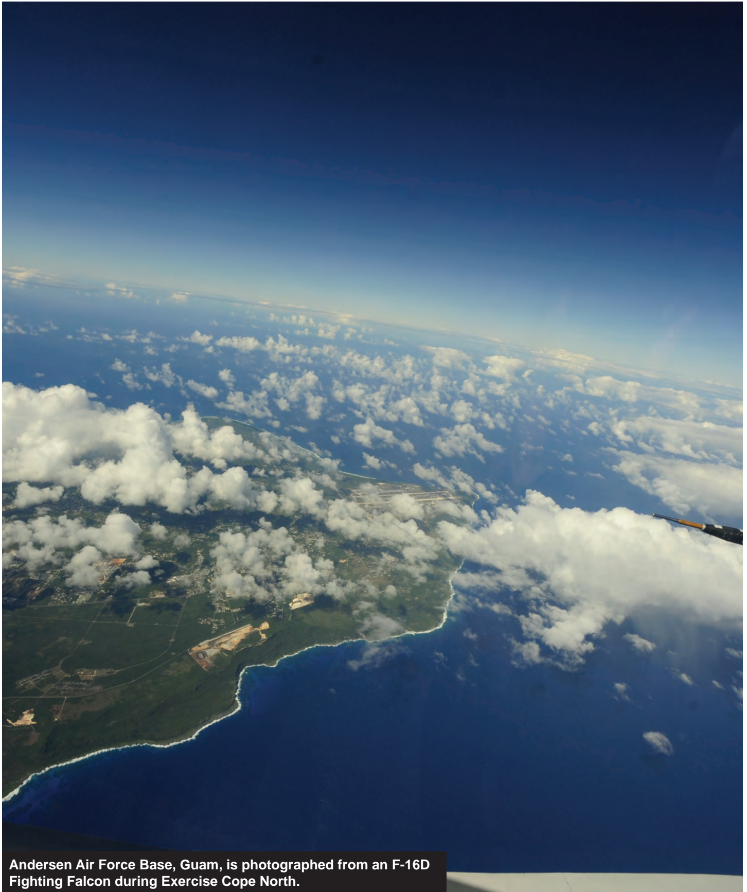
Andersen Air Force Base, Guam, is photographed from an F-16D Fighting Falcon during Exercise Cope North.