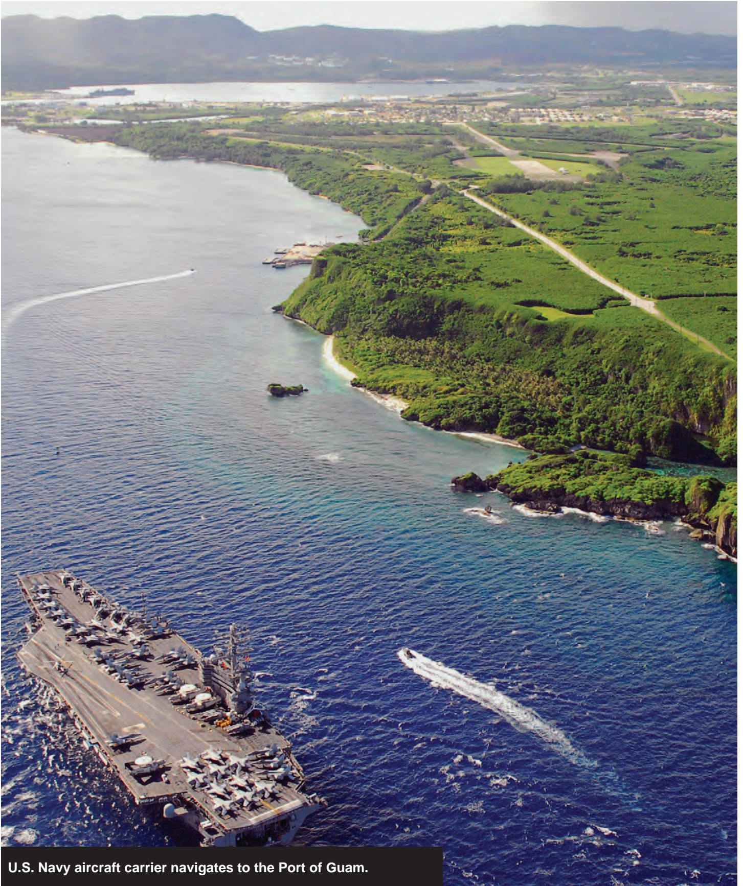
U.S. Navy aircraft carrier navigates to the Port of Guam.