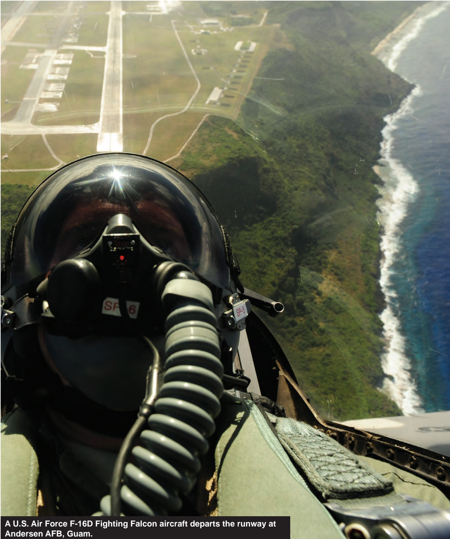
A U.S. Air Force F-16D Fighting Falcon aircraft departs the runway at Andersen AFB, Guam.