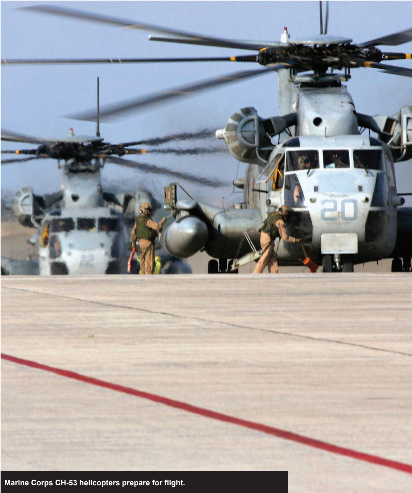
Marine Corps CH-53 helicopters prepare for flight.