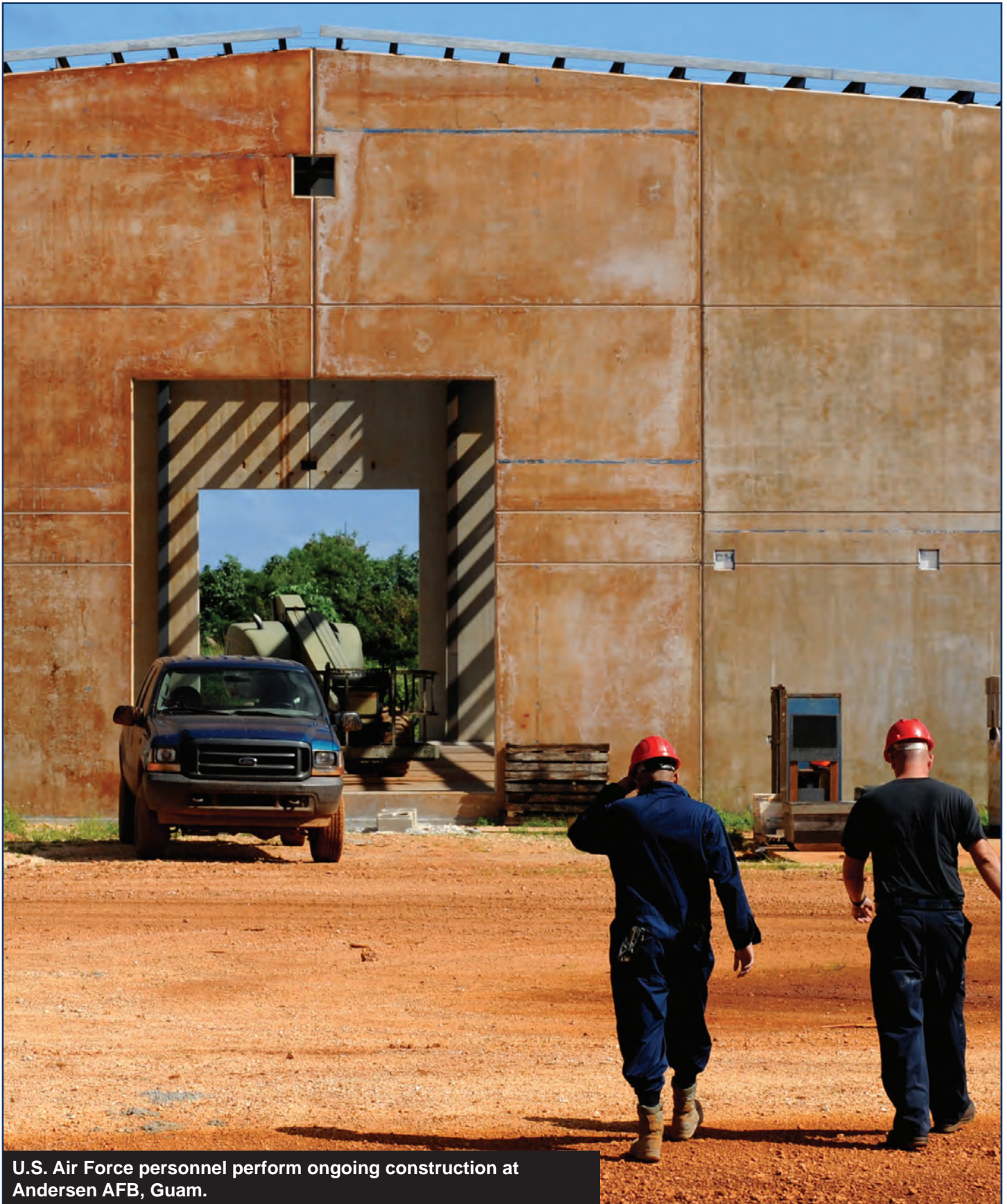
U.S. Air Force personnel perform ongoing construction at Andersen AFB, Guam.