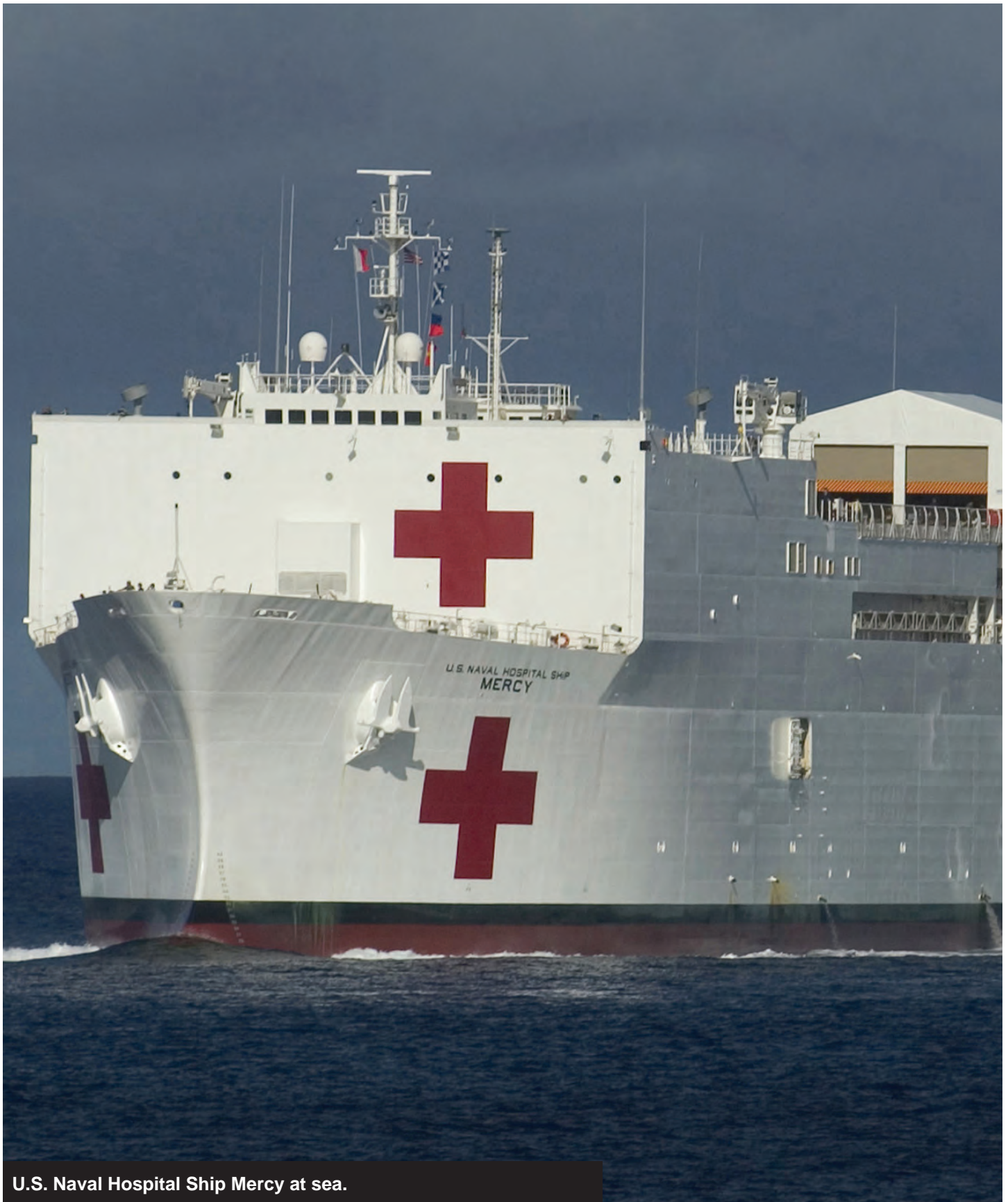
U.S. Naval Hospital Ship Mercy at sea.