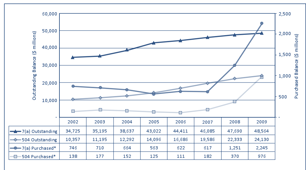
Chart 1: Growth in SBA 7(a) and 504 Loan Volume Moderated in 2008 While Losses Accelerated.

sion to liquidate. If a loss<sup>14</sup> exists, the lender must file a 10 Tab package for the SBA to purchase the unpaid principal amount of the guaranteed portion of the loan; this package requires certain underwriting, servicing, and liquidation documentation.<sup>15</sup> (See Chart 1 for information on the volume of guarantees purchased by the SBA since 2002.)