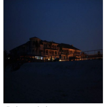
Impacts of light pollution controls: Before and after.