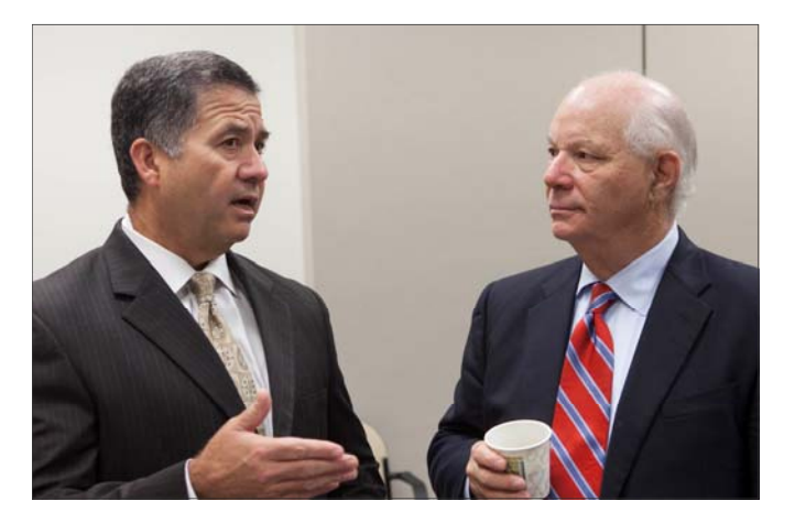
Deputy Commissioner David Aguilar and Senator Benjamin Cardin (D-MD).

On September 21, 2012, executives from 10 agencies on the Border Interagency Executive Council (BIEC) met to discuss key interagency collaboration issues.