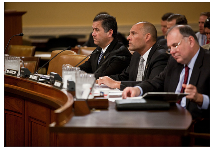
U.S. Customs and Border Protection Deputy Commissioner David Aguilar sits on the panel during the House Ways and Means Subcommittee hearing.

In May 2012, Deputy Commissioner Aguilar testified before the House Committee on Ways and Means, Subcommittee on Trade hearing titled, "Supporting Economic Growth and Job Creation