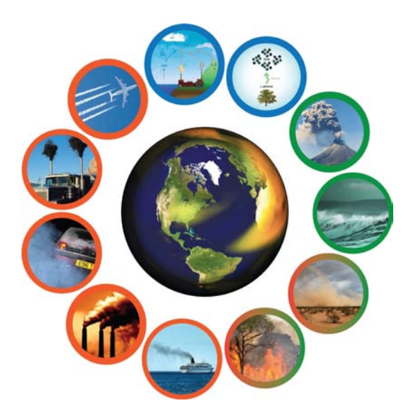
Figure 3 . Highly diverse sources of atmospheric aerosols (small images). Aerosols are emitted into the atmosphere both naturally (green circles) and as a result of human activities (red circles). They also are created and modified by chemical processes in the atmosphere (blue circles). These sources vary regionally, leading to highly variable amounts of aerosols in different parts of the globe, as shown in the middle circle (pollution aerosol plume over the North Atlantic from the United States; and the natural Saharan dust over the tropical Atlantic).