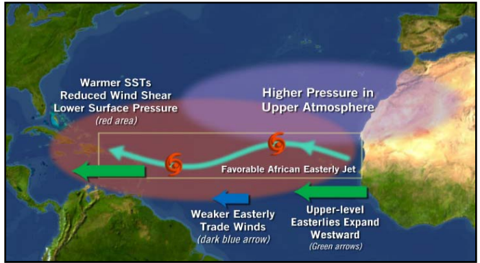
Figure 1: Factors conducive to increased Atlantic hurricane activity.

These conditions also produce more intense hurricanes.