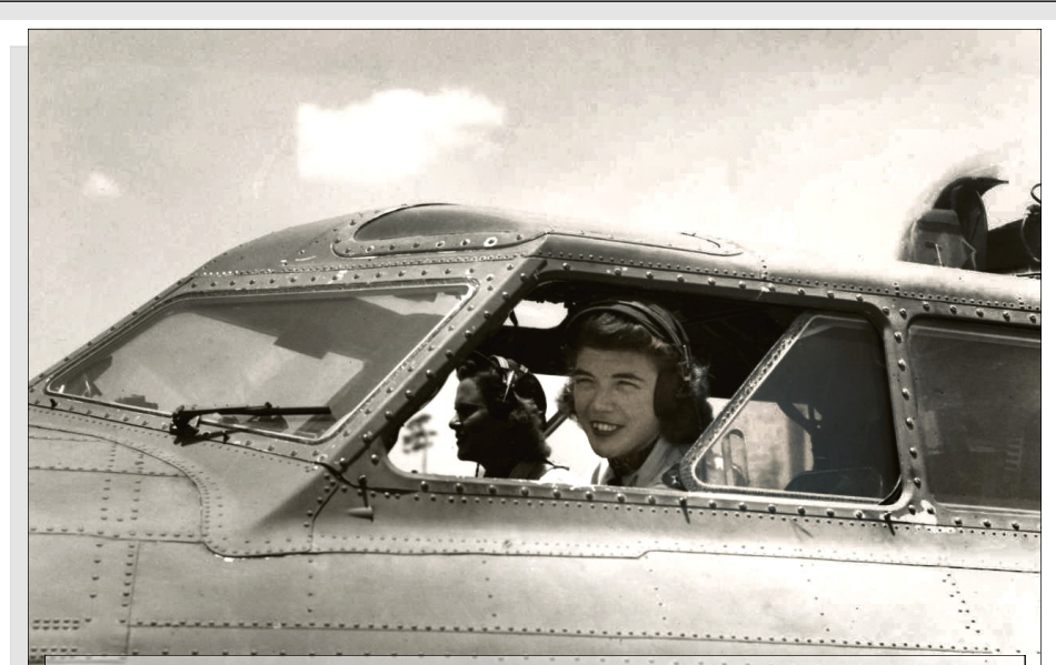
Dawn Seymour, one of 13 women qualified to fly B-17 bomber during World War II, looks out the cockpit window of a B-17 during a training mission. Seymour was one of five inductees into the Women In Aviation History, International Pioneer Hall of Fame.

Mrs. Foster said she is often asked what motivated her to