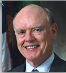
Treasury Secretary John W. Snow