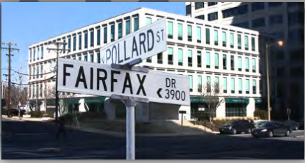
FinCEN's first address, Arlington VA