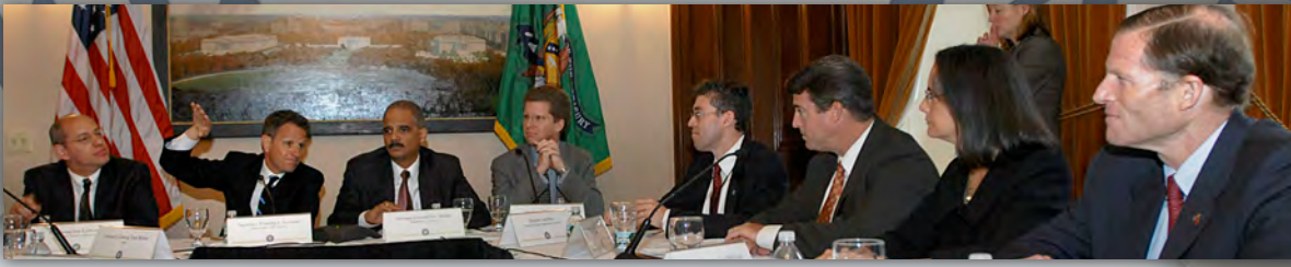
Cabinet level anti-fraud in housing market discussions