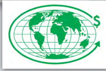
FinCEN's original seal