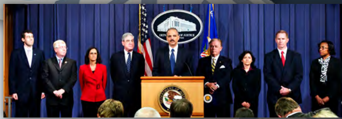
20th Anniversary of FinCEN