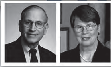
Treasury Deputy Secretary Stuart E. Eizenstat and Attorney General Janet W. Reno