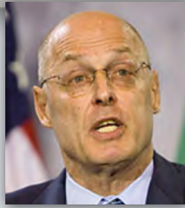
Treasury Secretary Henry M. Paulson, Jr.