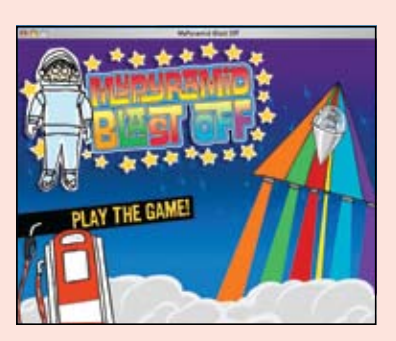
Figure H: MyPyramid Blast Off Game

The MyPyramid Blast Off game provides an example of how an interactive computer game with fantasy elements can help motivate children to learn