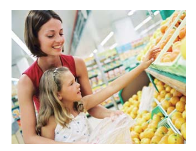
Figure A: Making a Bigger Impact—Together

Low-income mothers and their children are served by several Federal nutrition assistance programs. When these programs communicate the core nutrition messages to their participants, we can reach millions of mothers and children. The opportunity for message repetition is also greater since many moms participate or have children that participate in multiple programs. Examples of programs include: