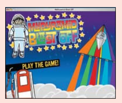
Figure H: MyPyramid Blast Off Game

The MyPyramid Blast Off game provides an example of how an interactive computer game with fantasy elements can help motivate children to learn