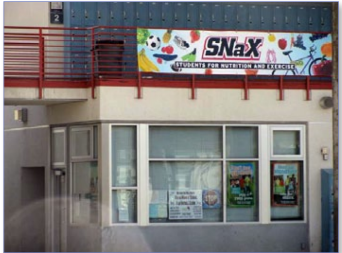
A banner promotes the SNaX program in a lunch area at Vista Middle School in Van Nuys, CA.

Results from a pilot study of SNaX at a middle school in Los Angeles were so promising that school district officials set aside $7 million for fruits that were popular with students. Organizers hope to continue expanding the program to further involve family and community members. ■