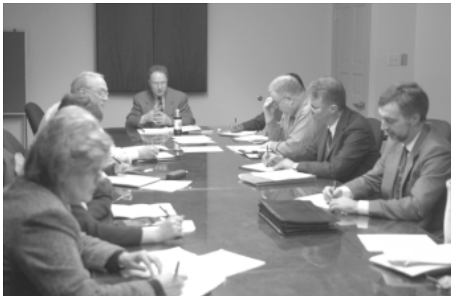
Task Force on Consumer Compliance meeting.

First, the working group identified changes in the data storage process that would result in cost savings to the agencies. Second, potential cost savings could be realized from reviewing the HMDA aggregate tables to ensure they continue to be useful. Third, the continued migration of HMDA products from CD-ROM to web-based applications would provide additional cost savings. The task force, with the approval of the Council, agreed to proceed with implementing these aforementioned cost-savings initiatives.