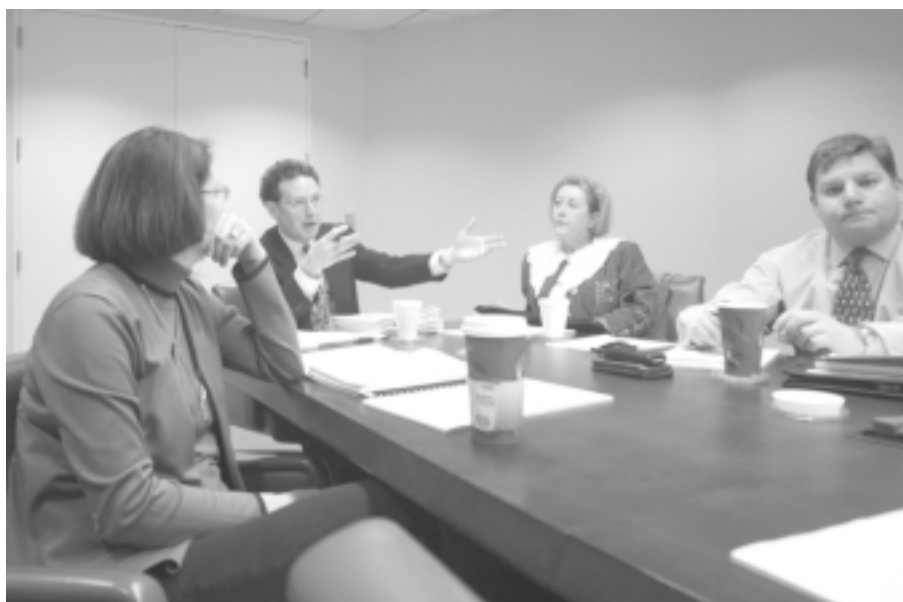
Task Force on Examiner Education meeting.

Charged with spearheading examiner education on behalf of the Council, the Task Force on Examiner Education promotes inter-agency education through timely, cost-efficient, state-of-the-art training programs for agency examiners. The task force develops programs on its own initiative or in response to requests from the Council or other Council task forces. Each fall, it develops a program calendar based on training demand from the five member agencies and state financial institution regulators. The task force also oversees the delivery and evaluation of programs throughout the year. During the past year, 2,643 regulatory staff