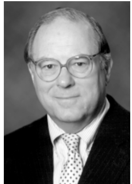
John D. Hawke, Jr. Comptroller of the Currency Office of the Comptroller of the Currency