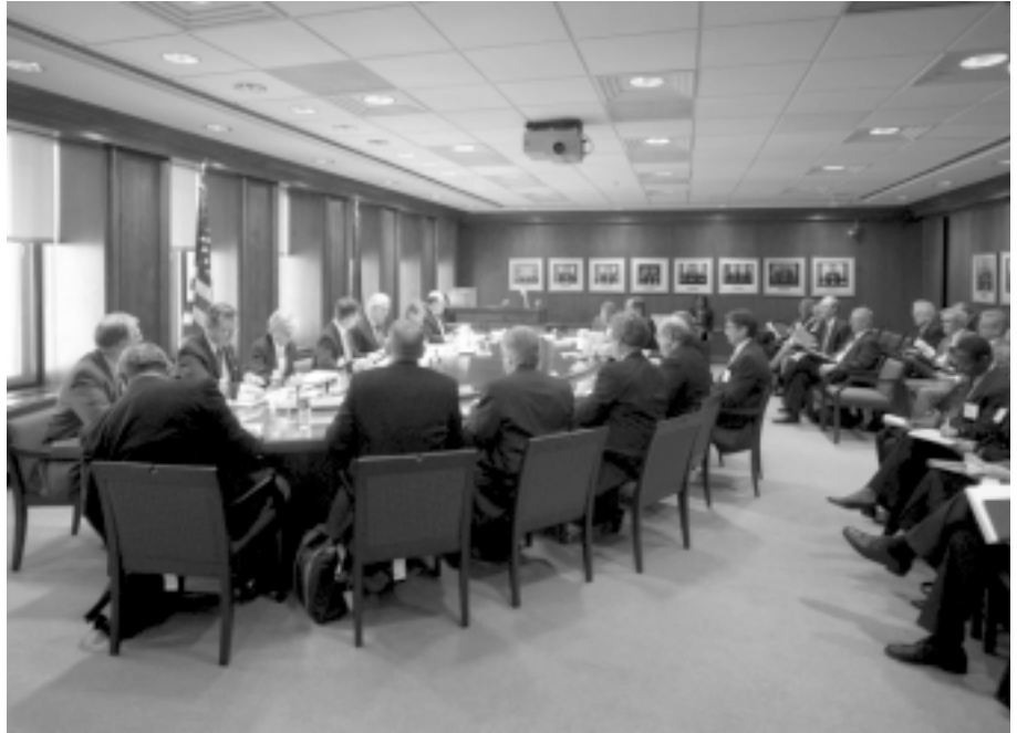
The Examination Council in Session.

Explanation. The Task Force on Examiner Education presented several alternatives for delivering the risk management seminar to bank-