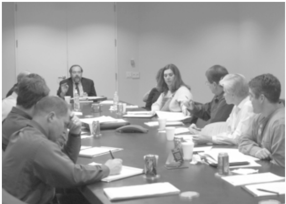
Task Force on Information Sharing meeting.

The chief initiative of the task force is to identify and implement technologies to make the sharing of interagency data more efficient. The task force's technology working group meets monthly to develop technological solutions to common