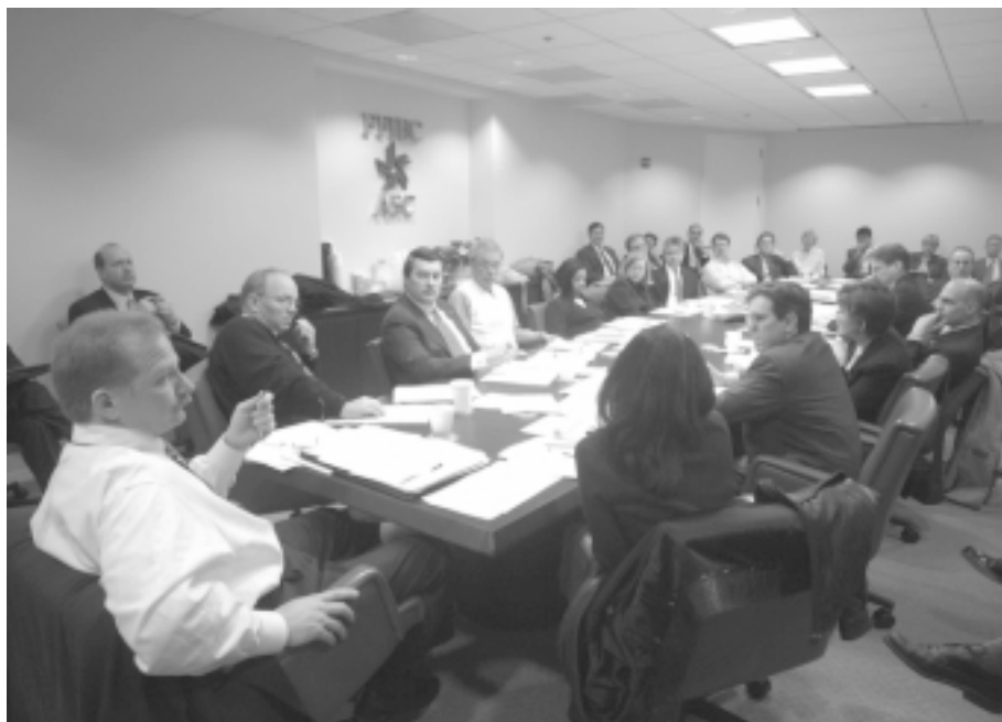
Task Force on Supervision meeting.

In May 2002, the federal banking agencies also issued the Interagency Advisory on the Unsafe and Unsound Use of Covenants Tied to Supervisory Actions in Securitization Documents. The purpose of the guidance is to alert institutions and examiners to the safety and