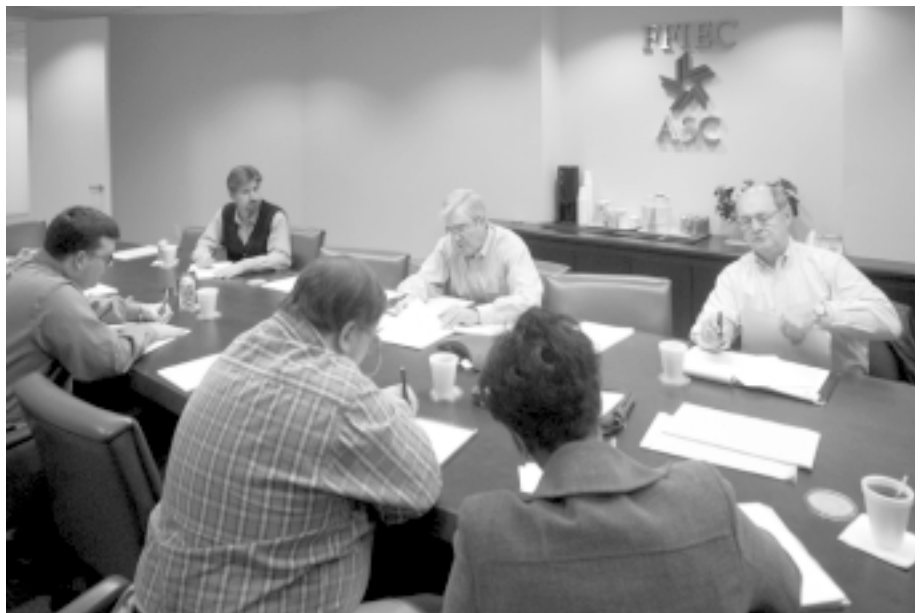
Task Force on Surveillance Systems meeting.

Fiduciary activities have also become more important for some banks. Accordingly, the task force added two new pages to the 2002 version of the UBPR. The pages incorporate new data on trust activities collected on the Call Report. Data on the volume of activity by line, data on managed and non-managed accounts, and peer data is now included on the UBPR and available on the FFIEC website. Additionally, extensive confidential data on earnings, expenses, and losses by type of account have been made available to the bank supervisors.