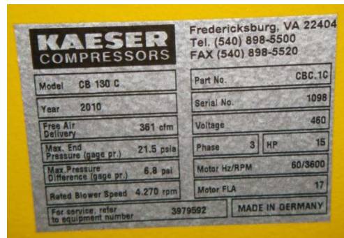
Kaeser positive displacement blower marking plate.

Goshen installed one Kaeser Omega Com-Pak Plus CB 130C positive displacement blower that was marked as “MADE IN GERMANY.” To support compliance with Buy American requirements, the city provided a single electronic file that included the following documents: (1) two letters from Kaeser Compressors, Inc., dated February 4, 2010, and October 13, 2011; (2) answers to EPA’s substantial transformation questions; and (3) a copy of the positive displacement blower invoice.