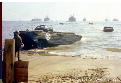
Amphibian trucks (DUKWs) bring supplies to a landing beach in Southern France, August 1944.

KEY: † Military Cemetery 🪂 Parachute Drop