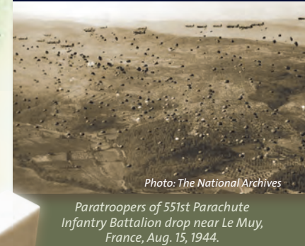
Paratroopers of 551st Parachute Infantry Battalion drop near Le Muy, France, Aug. 15, 1944.

The graves area is divided into four plots surrounding the oval center pool. Olive trees among the 861 headstones lend an unforgettable peacefulness to the scene.