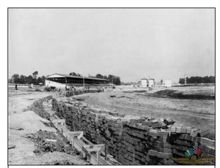
The original tar and crushed rock surface proved to be too dangerous, so the track was covered with 3.2 million paving bricks in the fall of 1909.