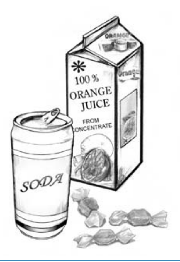
Have one of these "quick fix" foods when your blood glucose is low.

After 15 minutes, check your blood glucose again to make sure your level is 70 or above. Repeat these steps until your blood glucose level is 70 or above. Once your blood glucose is stable, if it will be at least an hour before your next meal, have a snack.