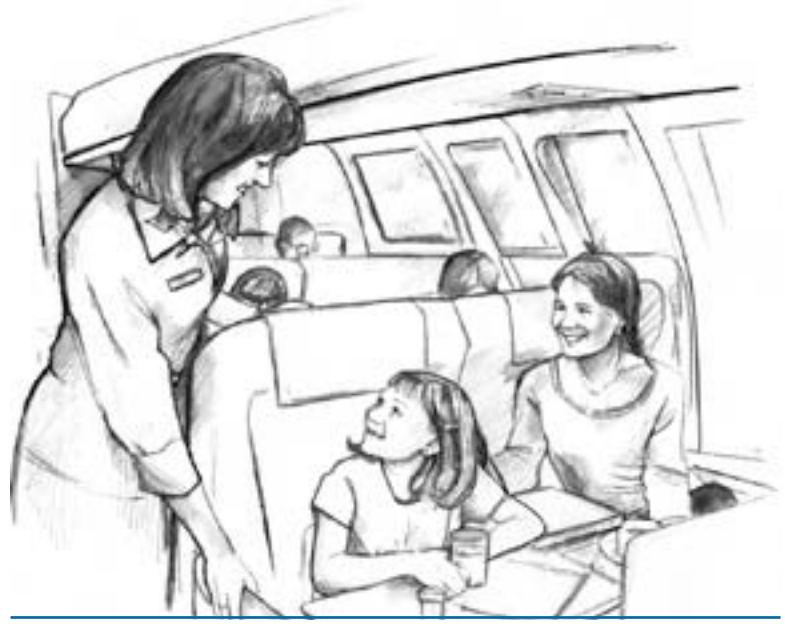
When traveling by plane, bring food for meals and snacks.