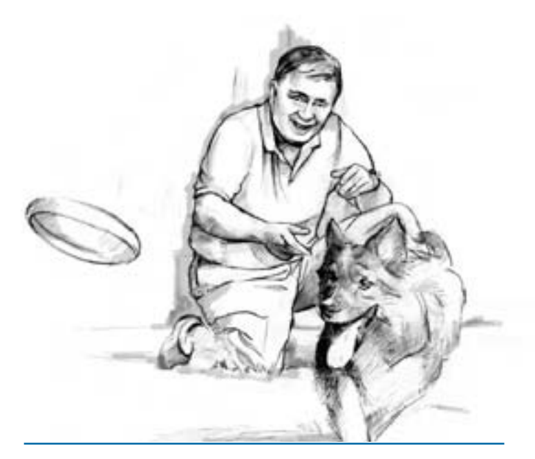
Being active helps you stay healthy.

Before you begin exercising, talk with your doctor. Your doctor may check your heart and your feet to be sure you have no special problems. If you have high blood pressure or eye problems, some exercises like weightlifting may not be safe. Your health care team can help you find safe exercises.