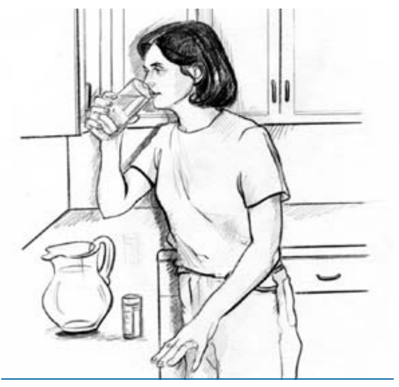
Many people with type 2 diabetes take pills to help keep blood glucose in their target range.

Three kinds of diabetes medicines can help you reach your blood glucose targets: pills, insulin, and other injectable medicines.