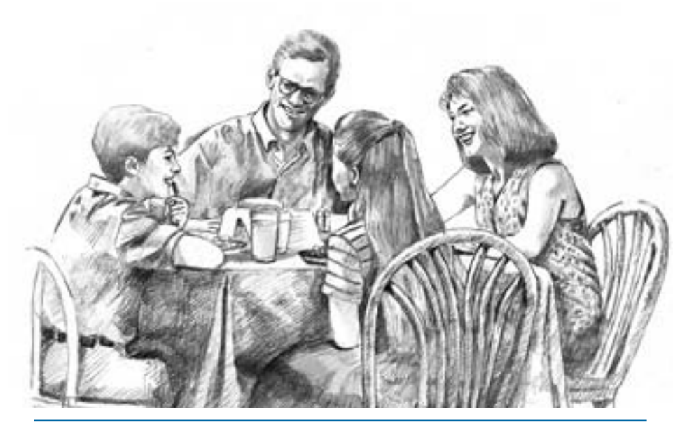
You can learn how to take care of your diabetes.

Your doctor says you have diabetes. You can learn how to take care of your diabetes and how to prevent some of the serious problems that diabetes can cause. You may want to share this booklet with your family and friends so they too will understand more about diabetes and how they can help you live a healthy life. And remember, you can always ask your health care team any questions you might have.