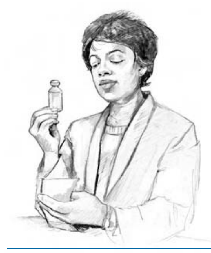
You may need insulin to control your blood glucose.

Your doctor can tell you which of these ways to take insulin is best for you.