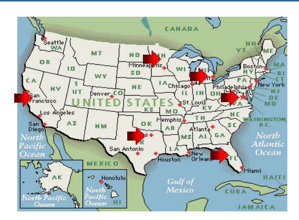
Six Driver Clinic Sites