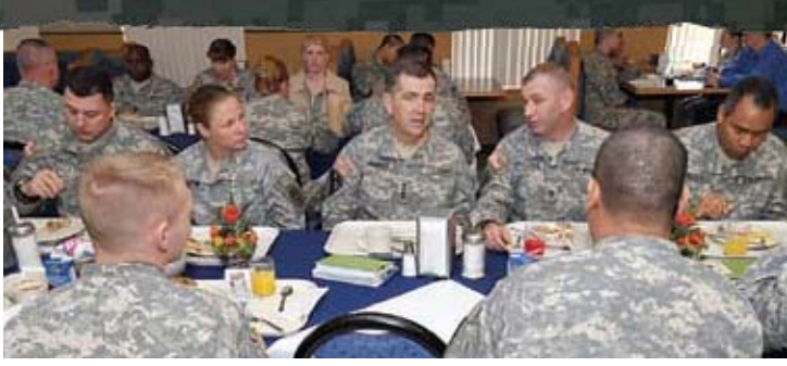
Vice Chief of Staff GEN Chiarelli visits with Soldiers at Ft Drum

On March 23, the Army Suicide Prevention Task Force and Army Suicide Prevention Council were established to rapidly analyze and assess existing programs and develop