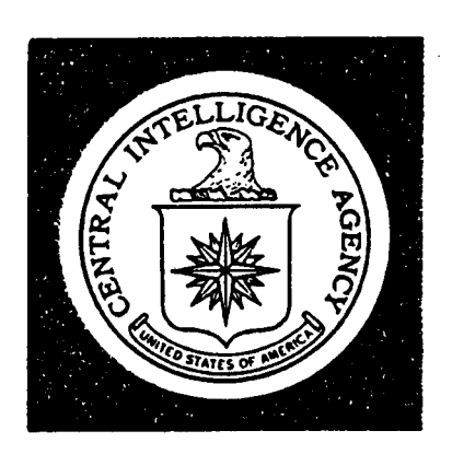
DIRECTORATE OF INTELLIGENCE