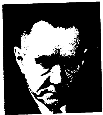
Kosygin: Minority Premier