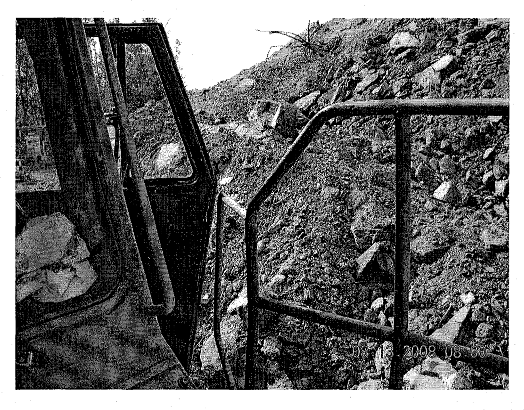
Photograph 2. Close up of guard from deck of haul truck