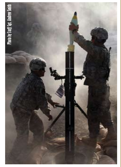
Troops with the 25th Infantry Division operate in Paktika province, Afghanistan, in July 2009.