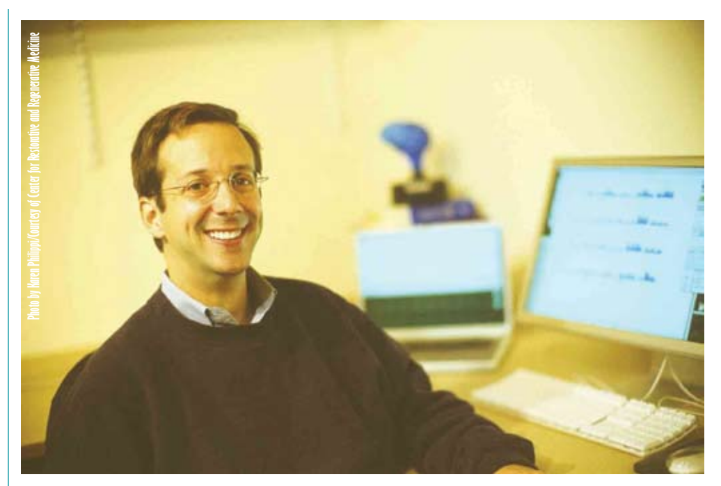
Leigh Hochberg, MD, PhD, is lead investigator on two clinical trials of a brain-computer interface called BrainGate.

This approach avoids some of the risks of brain implants, and may eventually prove viable for many patients with disabilities. One drawback with EEG, however, is that the output is less precise than with implants, and users need far more training than with BrainGate to effectively control a cursor.