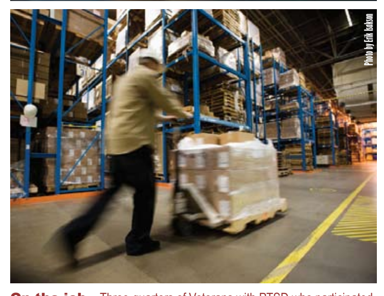
On the job —Three-quarters of Veterans with PTSD who participated in an "individual placement and support" program as part of a VA study were able to find competitive jobs.