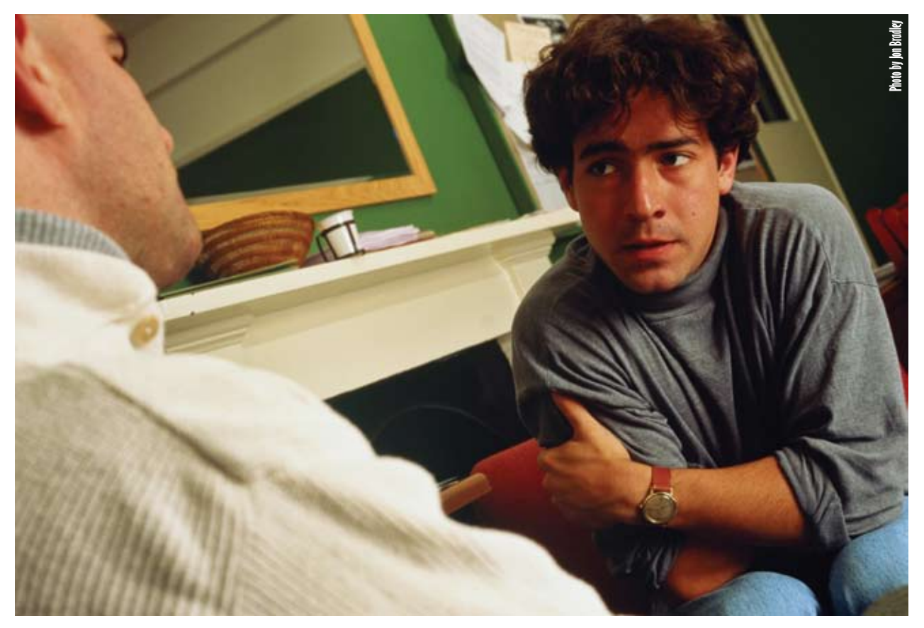
Therapy insight—New research suggests that prolonged exposure therapy, a form of psychotherapy that is widely used in VA as a firstline treatment for posttraumatic stress disorder, may be just as effective even when patients have mild to moderate traumatic brain injury, along with PTSD. See item below.