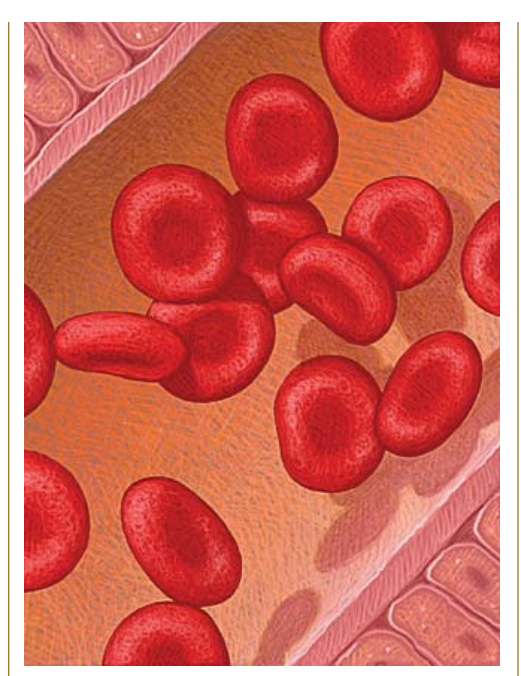
The French connection —The link between blood clotting and cancer, first observed by a French doctor in the 1800s, continues to intrigue oncology researchers.

Specifically, the type of antibodies being used are monoclonal antibodies, so named