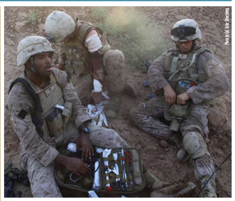
The resilience factor — Navy corpsmen tend to a Marine wounded in a firefight in Afghanistan. In the Marine Resilience Study, VA and Department of Defense investigators hope to zero in on the factors that enable troops to withstand and recover from the emotional stress of war.

Some insights have come from studies of twins. If a trait is found in combat veterans with PTSD but not in their genetically identical brothers, it is considered a probable result of PTSD, not an inborn risk factor. But according to Baker, studies have yielded mixed findings and more research is needed. By collecting