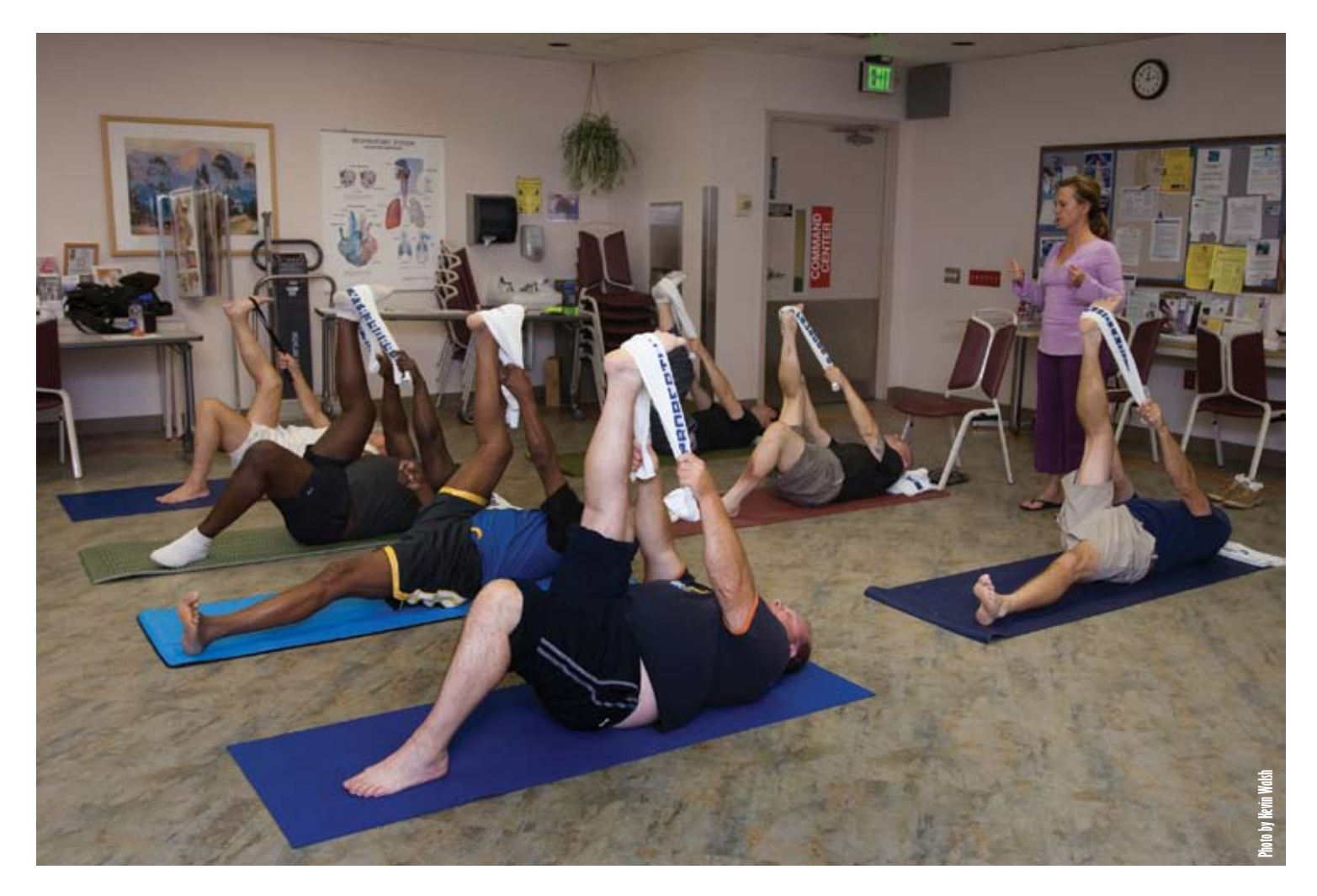
A leg up on back pain—A VA study has confirmed that yoga can relieve low-back pain and provide other health benefits.