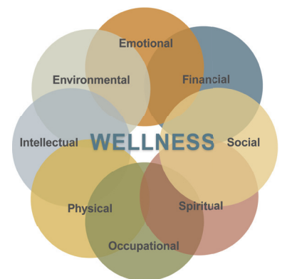
FIGURE 1: Eight Dimensions of Wellness