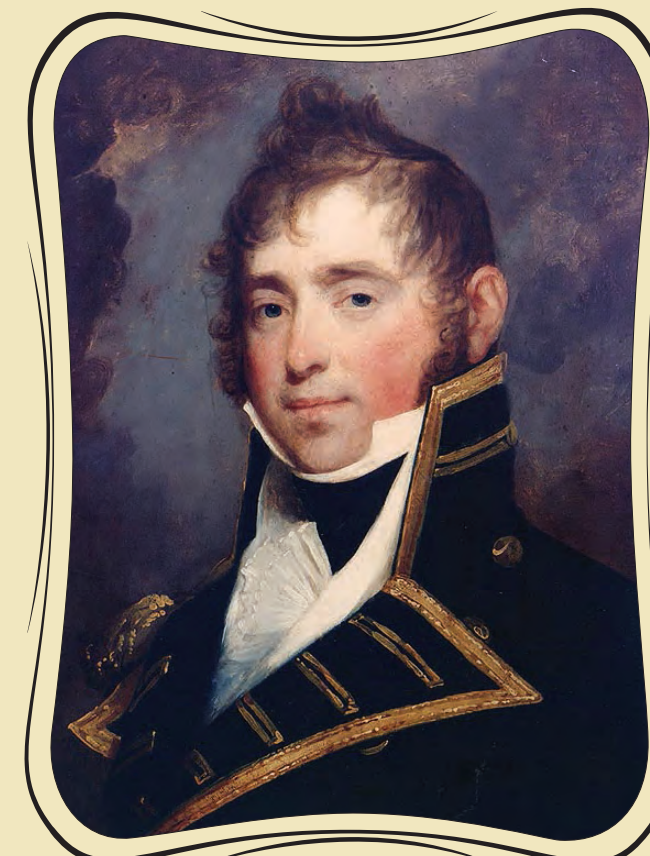
Captain James Lawrence.

During the war, Boston and the Charlestown Navy Yard served as homeport for the city's beloved "Old Ironsides," the frigate Constitution , which had been launched from a private Boston yard in 1797 and earned fame and its nickname during the war. The U.S. frigates Chesapeake , Congress , President , and United States also used Boston as a base in the course of the war. One of the Navy's first ships of the line, Independence , launched from the Charlestown Navy Yard, and the U.S. sloop of war Frolic was built in a private yard in Boston during the war.