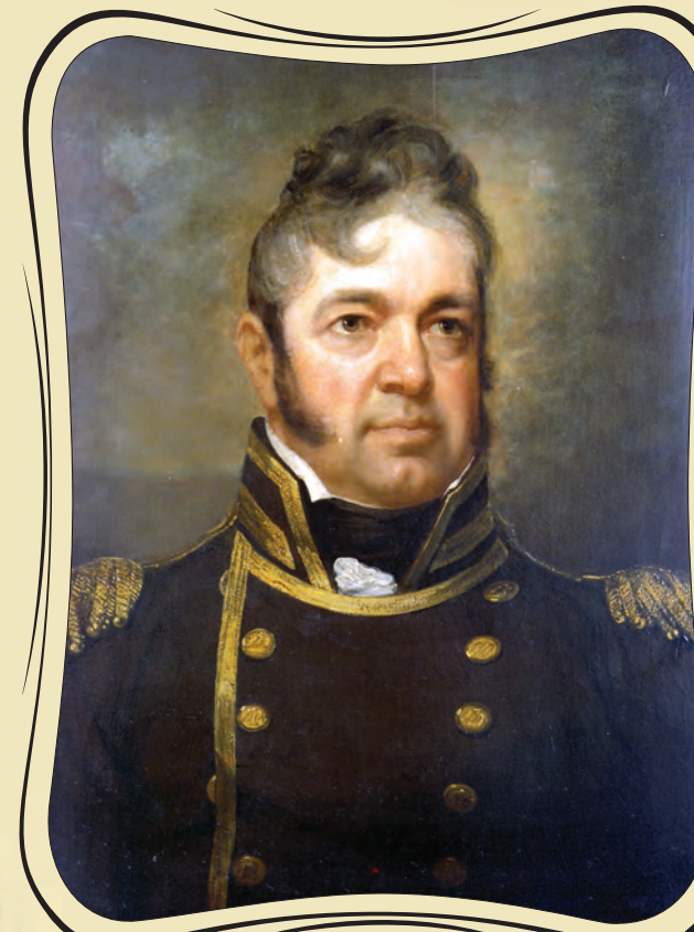
Commodore William Bainbridge, one of USS Constitution's wartime commanders.