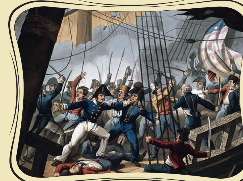
Officers and crew of USS Shannon boarding and capturing HMS Chesapeake, June 1, 1813.