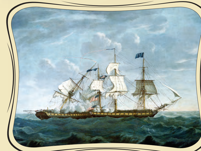
USS Constitution and HMS Guerriere, August 19, 1812. (U.S. Naval Academy Museum)