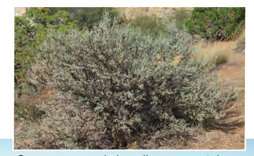
Sage-grouse rely heavily on mountain and Wyoming big sagebrush for food and cover.

Other sources of information on sage-grouse include the U.S. Fish and Wildlife Service, the U.S. Bureau of Land Management, and state fish and game departments.