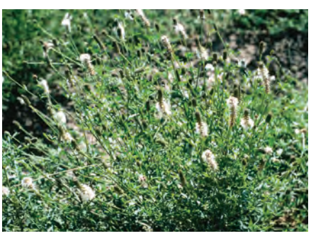
Antelope germplasm slender white prairie clover.