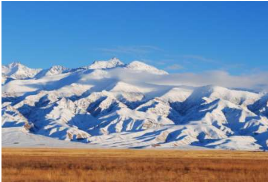
Tian Shan Mountains, the Kyrgyz Republic