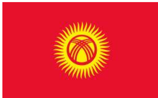
Flag of the Kyrgyz Republic