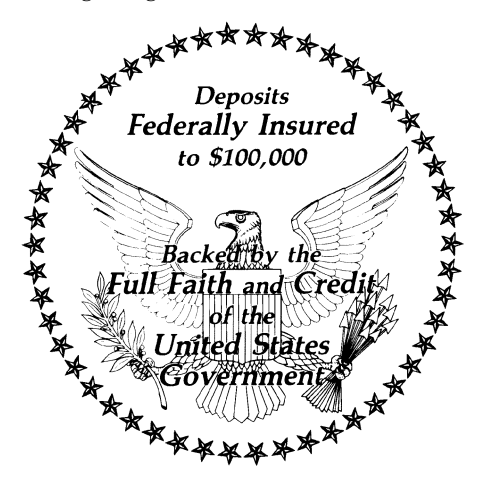
[54 FR 33670, Aug. 16, 1989, as amended at 57 FR 45977, Oct. 6, 1992]

(b) Official savings association sign. The official sign referred to in this paragraph (savings association sign) shall be 5\frac{1}{8} " in diameter and of the following design: