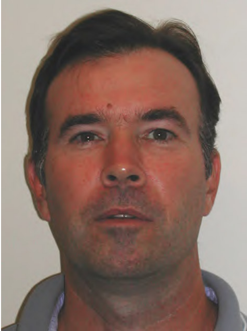
Figure 2. 480x640 pixel image compressed to 10.3 kB using JPEG2000. Distortion (PSNR)=36.0 dB.

The following example uses a facial image with dimensions 640x480 pixels, as specified in the PIV standard draft. Such an image contains 307,200 pixels, and is 921.6 Kbytes in size uncompressed. The images in Figures 2 and 3 show this image being compressed to 10.3 Kbytes (compression ratio of 88:1) using JPEG2000 (Figure 2); and to 21.0 Kbytes using JPEG (Figure 3). Both result in equal distortion (PSNR=36 dB), but JPEG2000 achieves significantly better compression, and a final file size roughly half of the JPEG image.