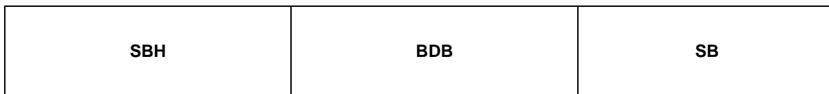
Figure 1 – CBEFF Record Sections

SBH – Standard Biometric Header, BDB – Biometric Data Block, SB – Signature Block.