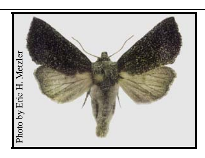
Blazing Star Stemborer (Papaipema beeriana)

This nondescript moth is listed as endangered by the State of Ohio. It was first discovered at WPAFB during a survey of Huffman Prairie in 1992. An expert is usually required to identify this moth. They inhabit tall grass prairies, prairie remnants, and similar habitats where their larvae feed on the plants in the Liatris genus (blazing star and gayfeather plants).