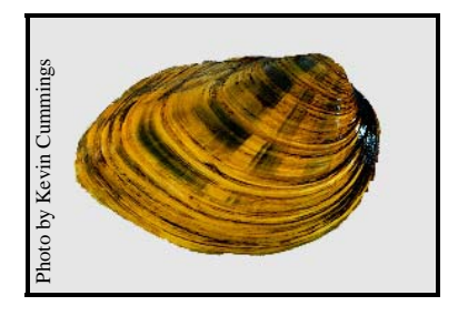
Clubshell (Pleurobema clava)

This nondescript moth is listed as endangered by the State of Ohio. It was first discovered at WPAFB during a survey of Huffman Prairie in 1992. An expert is usually required to identify this moth. They inhabit tall grass prairies, prairie remnants, and similar habitats where their larvae feed on the plants in the Liatris genus (blazing star and gayfeather plants).