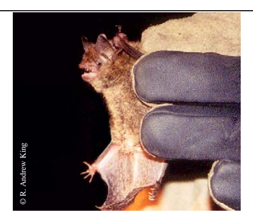
Indiana Bat (Myotis sodalis)

Massasaugas are most likely to be encountered south of Hebble Creek in Area C including the Warfighter Training Area, Twin Base Golf Course, and the former Horse Barn area (see map). Take some precaution when visiting these areas. If you encounter a massasauga on base, please notify WPAFB's Natural Resources Manager.