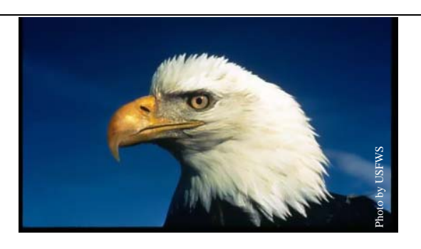
Bald Eagle (Haliaeetus leucocephalus)

It is a violation of federal law to harass, kill, harm, or take any of these species!