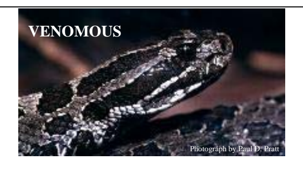
Eastern Massasauga Rattlesnake