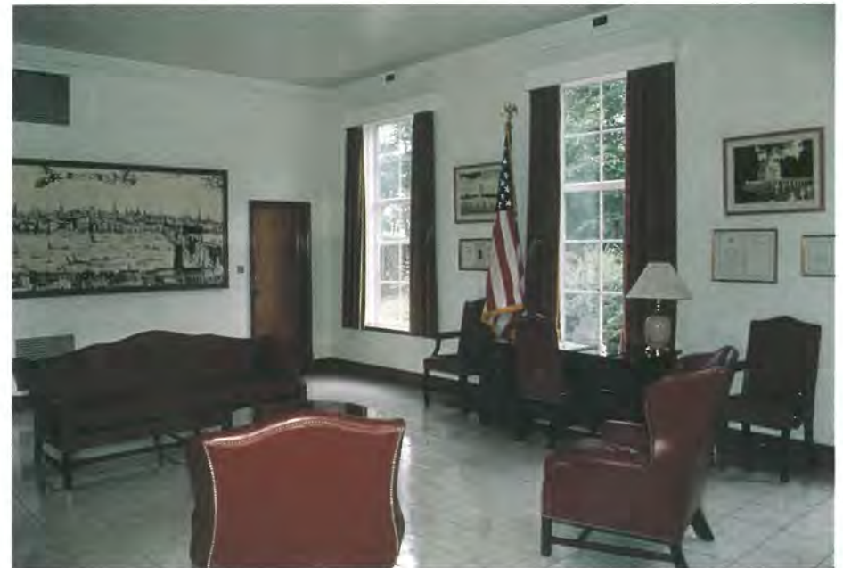
Interior of Visitors' Building

The words FAITH and HOPE in bronze letters are set into the chancel rail in the chapel. A cloth of mail is spread over the Portland stone altar on which rests a large bronze cross. At the altar base rests the Tablets of Moses. Flanking the altar are two large ornamental candelabra, also embellished with mosaic.