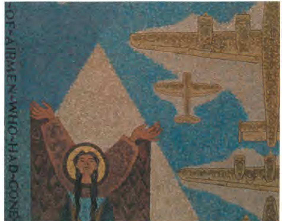
Mosaic Ceiling of Chapel

Immediately inside the main entrance to the cemetery is the Visitor's Building. It contains the Superintendent's office and a comfortably furnished room where visitors may obtain information, sign the register and pause to refresh themselves. During visiting hours a member of the cemetery staff is available in the building to answer questions and provide information on burials and memorializations in the Commission's cemeteries, accommodations in the vicinity, travel, local history and other items of interest.