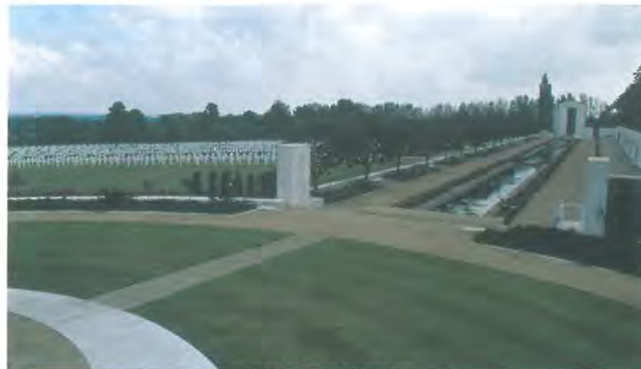
Entrance to the Great Mall and Graves Area

The Cambridge American Cemetery, 30.5 acres in extent, is one of fourteen