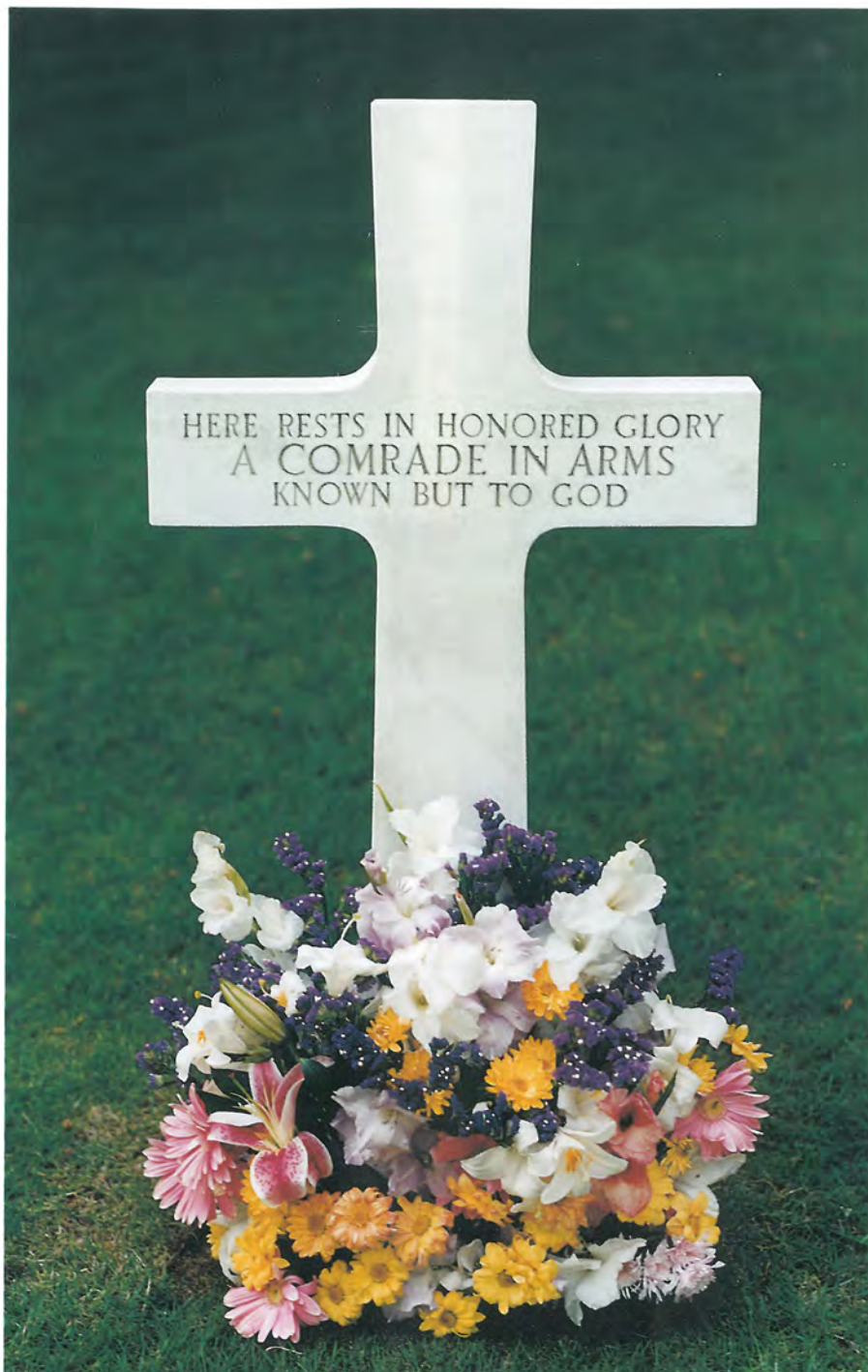
Decorated Gravesite of a World War II "Unknown"