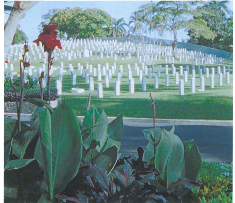
Corozal American Cemetery, Corozal, Republic of Panama