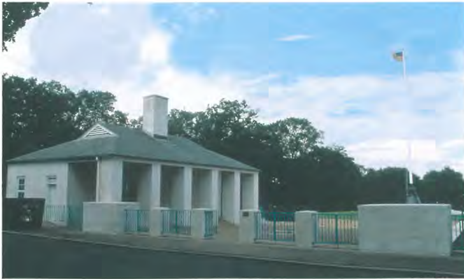
Exterior of Visitors' Building

TINUED TO FLY MISSIONS AT NIGHT. THE OBJECTIVE WAS THE PROGRESSIVE DISLOCATION AND DESTRUCTION OF THE ENEMY'S MILITARY, INDUSTRIAL AND ECONOMIC SYSTEM. EVER PRESENT WAS THE NECESSITY OF BEATING DOWN THE GERMAN FIGHTERS WHICH ATTACKED OUR HEAVY BOMBERS FIERCELY AND PERSISTENTLY.