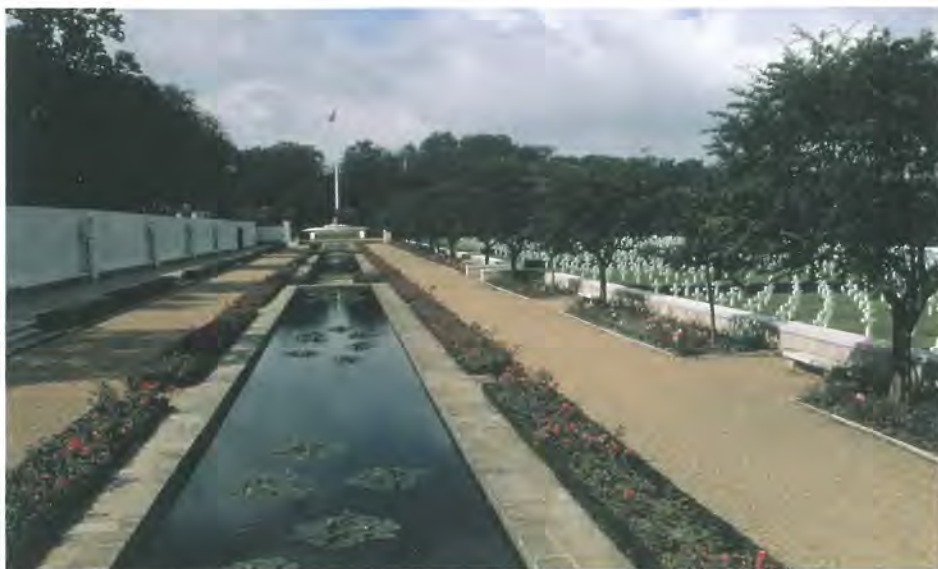
Reflecting Pool with Tablets of the Missing and Graves Area in Background

Just beyond the Visitors' Building is a 72-foot flagpole on a tall platform whose base is inscribed with the following quotation from John McCrae's poem, In Flanders Fields : "TO YOU FROM FAILING HANDS WE THROW THE TORCH — BE YOURS TO