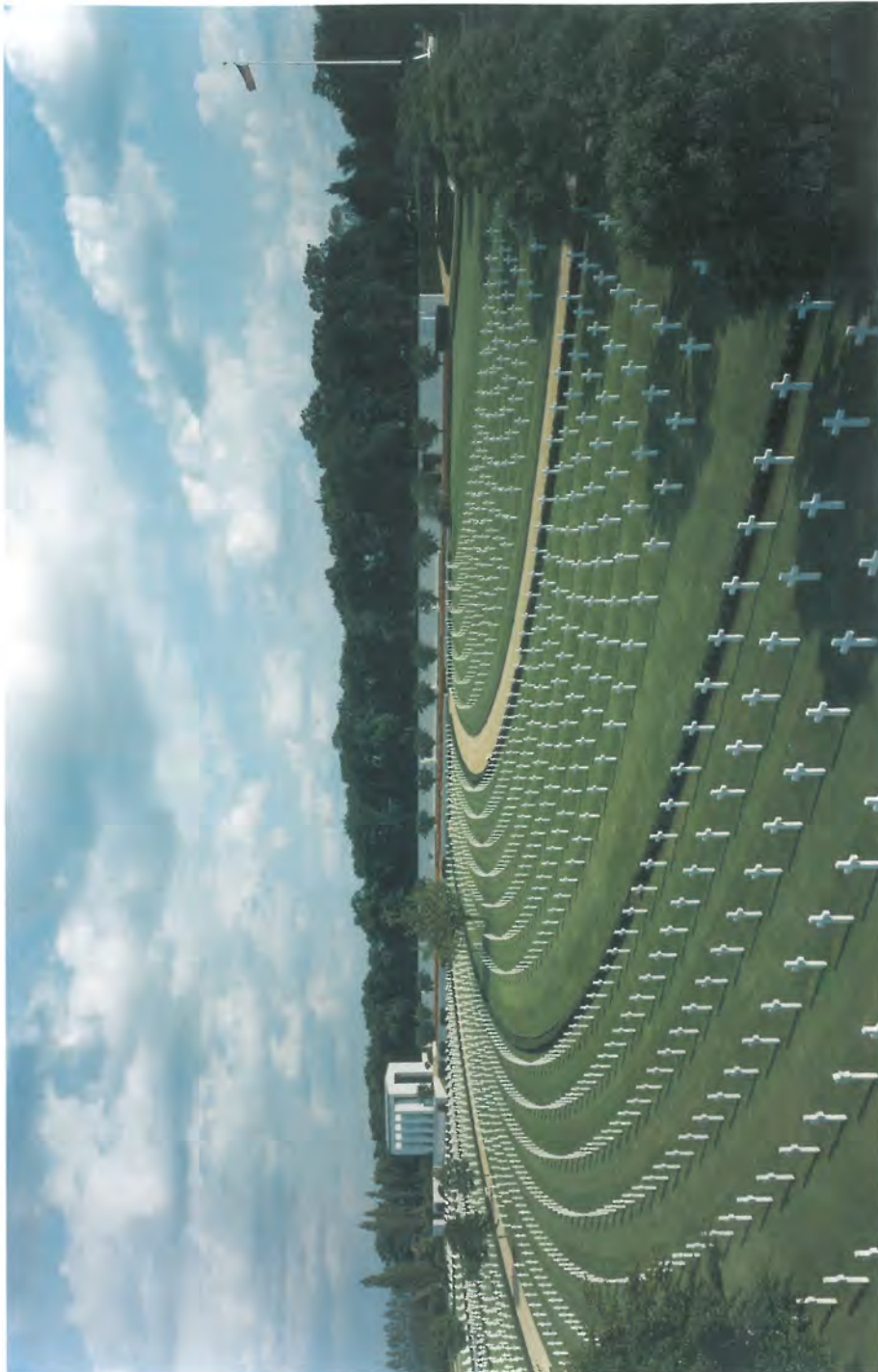
Overall View of Cemetery