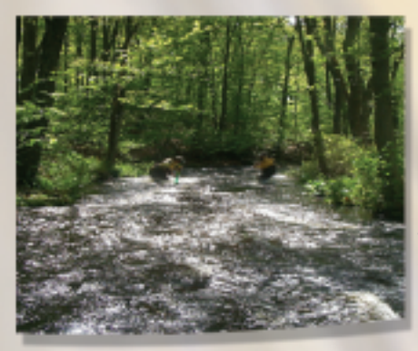
The CRWA is testing a revolutionary flow trading concept. This approach offers economic incentives to reduce impervious surfaces and promote groundwater recharge and water flow.