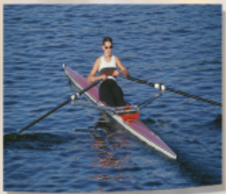
Cleanup efforts will enhance recreational opportunities.