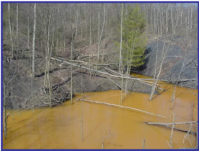
A representative stream in the Huff Run Watershed, affected by acid mine drainage.