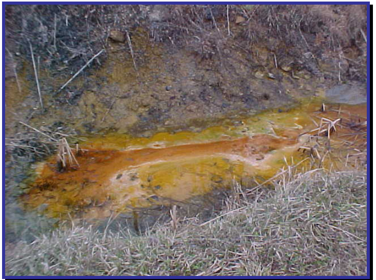
Part of the Belden project site that will be reclaimed with TWG funds.