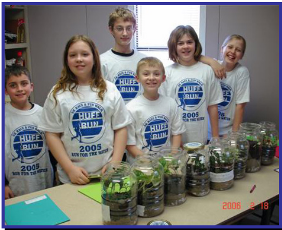
An Environmental Explorers Club (EEC) meeting where members made terrariums.